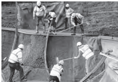
Pool construction by Canvas, November 2017.