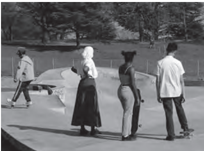
After school skaters, April 2018.