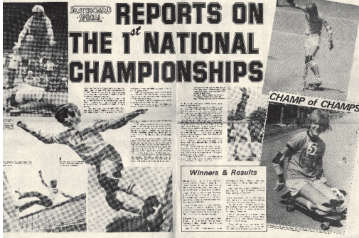
1977 UK National Championships. Skateboard Special , Issue 1 (September 1977).