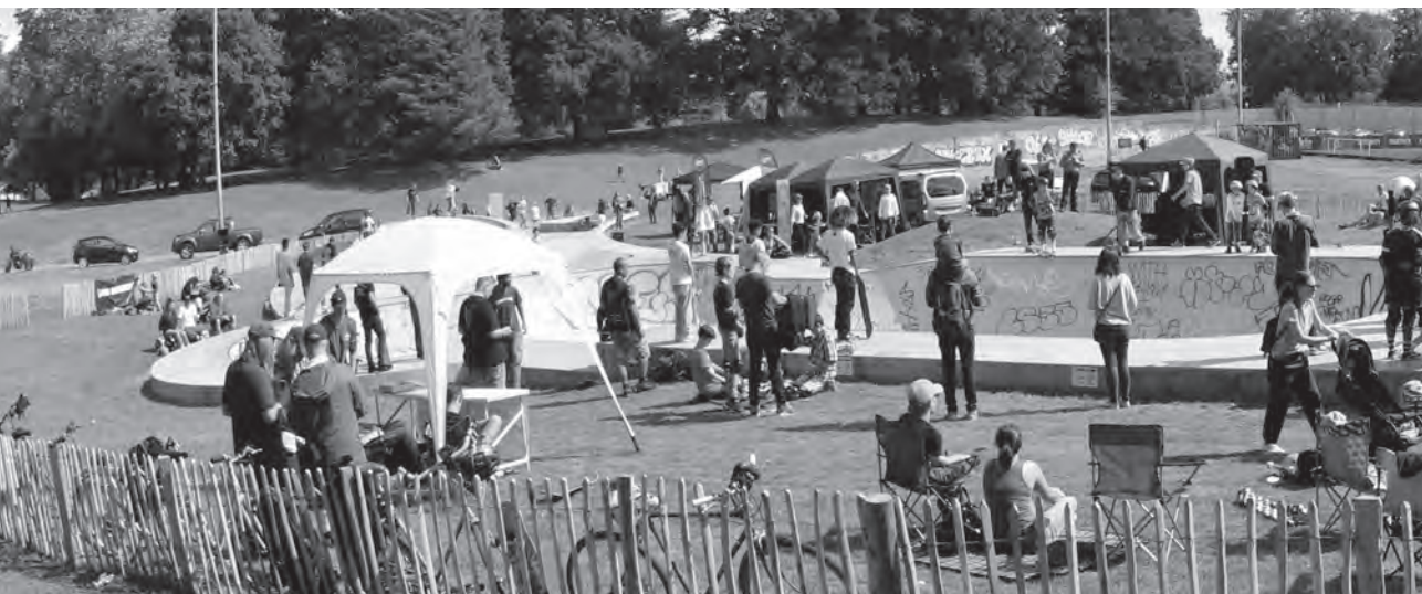
Summer Jam, August 2018.

Crystal Palace skatepark incorporates a tile-and-coping pool, a large BMX-friendly bowl, and shallow slopes particularly suitable for younger riders. Excluded are steps, rails and other street features; and myriad roll-ins and overhangs were left out for cost reasons. The park is decidedly oriented towards experienced 'transition' riders, but also accommodates those with different preferences and expertise. In short, design emerged here as an amalgam of desires and compromises.