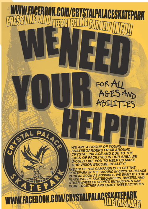
Crystal Palace Skatepark Campaign Flyer, 2015, Facebook.

A massive stroke of luck occurred, when Chinese billionaire Ni Zhaoxing's plans to rebuild the park's famous Joseph Paxton-designed Crystal Palace building (destroyed by fire in 1936) as a hotel and conference centre were stymied by planning complexities. To off-set the London Borough of Bromley's loss of income, in 2015 the Greater London