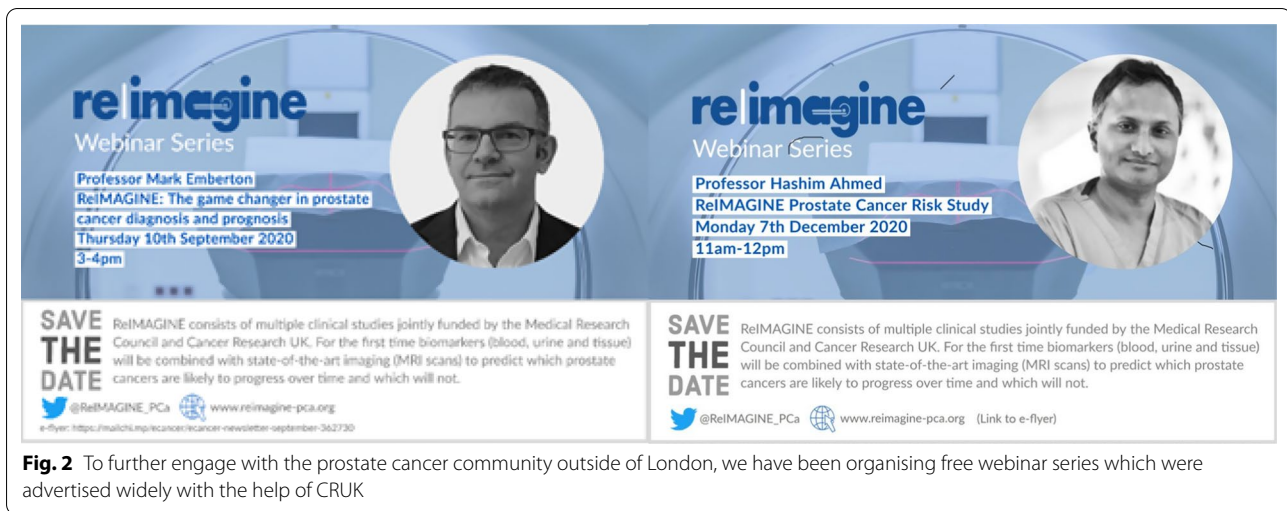
Fig. 2 To further engage with the prostate cancer community outside of London, we have been organising free webinar series which were advertised widely with the help of CRUK