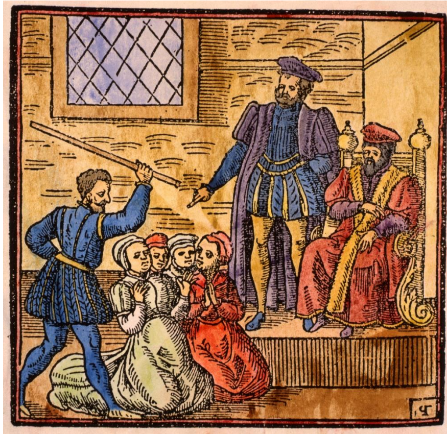
Figure 1. Suspected witches are threatened in front of two magistrates in a woodcut printed in Newes from Scotland . The seated man was commonly, and erroneously, identified as King James VI.

the privy council, examined the suspected witches and authorized the use of torture. All of them were found guilty and sentenced to strangling and burning.