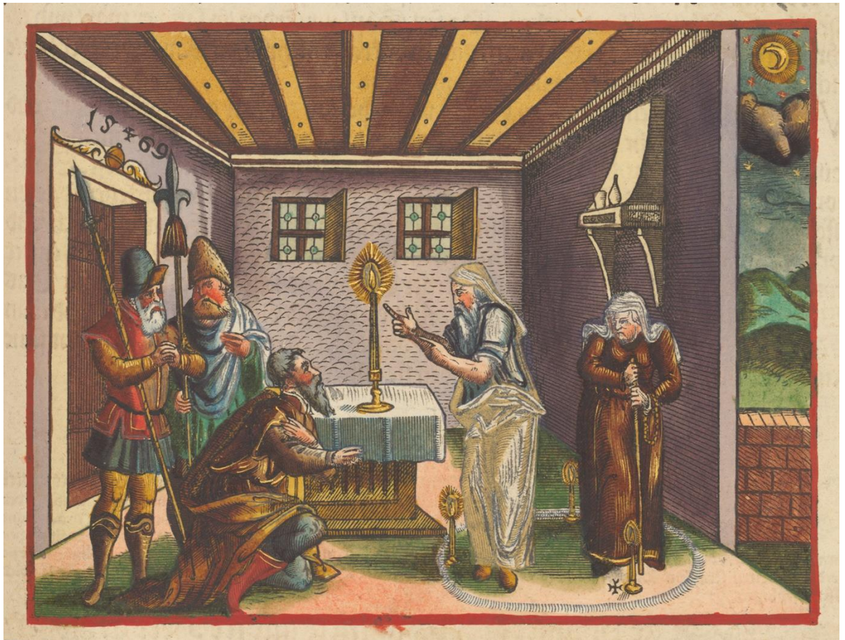
Figure 2. The woman of Endor as a ritual magician in a woodcut from the 1572 Wittenberg edition of the Luther Bible. Biblia Das ist: Die gantze heilige Schrift Deusch. D. Mart. Luth. , Wittenberg [Hans Krafft], 1572, p. 197.

thus emphasising the malign character of the woman of Endor and the demonic nature of Samuel's apparition.