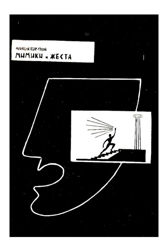
figure 5 Poster, the Moscow Theatre of Sign and Gesture, 1966

On 15<sup>th</sup> January 1957, the Soviet of Ministers of the RSFSR approved a proposal to establish a Theatre Studio within the VOG House of Culture in Moscow. Drawing on a tradition of amateur deaf theatre reaching back to before the revolution, the Studio was to train young deaf actors in all aspects of theatre craft, with the intention