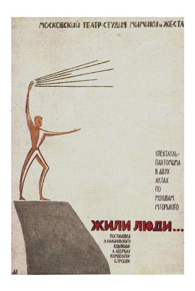
figure 6 Poster for Zhili liudi, 1963

glance, a smile, the smallest wave of the hand, the finger.'<sup>67</sup> At the Theatre Studio, the art of mime took a central role in the curriculum and improvised mime-études became a fundamental part of students' training in stage movement.<sup>68</sup> In 1963, the Theatre performed its first extended mime work, People Lived , sometimes referred to as Sparks from Danko's Heart (Iskra ot serdtsa Danko) , based on a short story by Maksim Gorky ( figure 6 ). According to a VOG report, 'the success of this work, which attracted a wide stratum of viewers, demonstrated the correctness of existing opinion, that the collective should devote more attention to the study of mime.'<sup>69</sup>