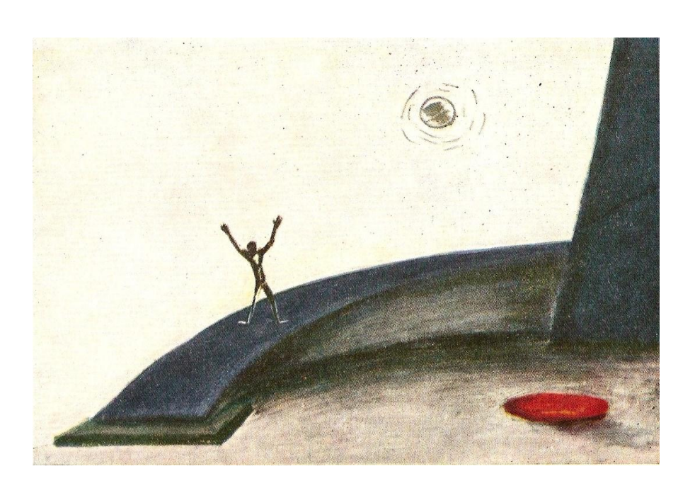
figure 8 Set design, Zhili liudi, 1963