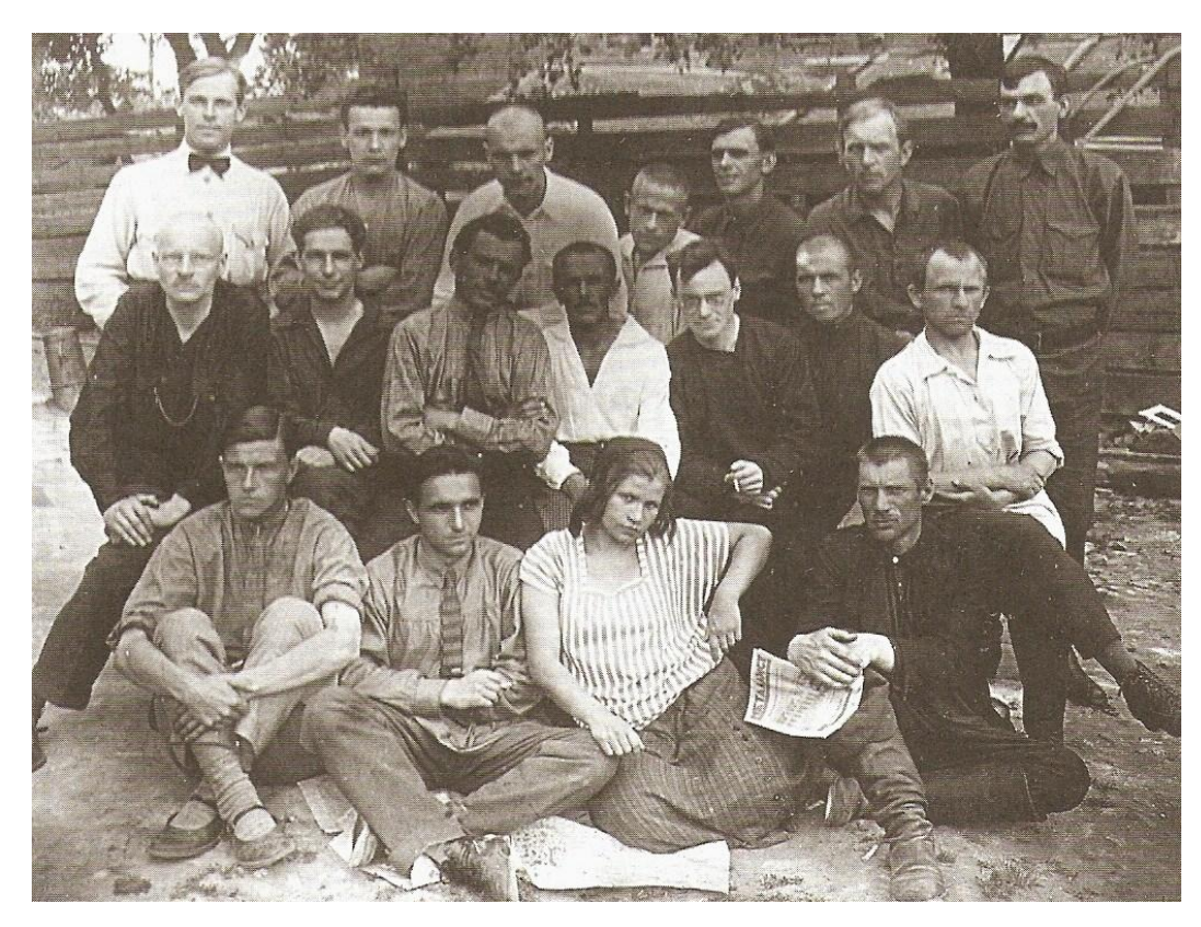
figure 1 Deaf-Mute Cell of the RKP(b), 1925

In October 1925, the fortnightly newspaper Zhizn' glukhonemykh (Life of Deaf-Mutes) published a short article entitled 'The Life of the Komsomol', celebrating the fourth anniversary of a deaf branch of the communist youth organisation in Saratov. <sup>1</sup> The article detailed an evening event held to celebrate this milestone: the benefits that communism had conferred on deaf individuals were palpable in the descriptions of the newly decorated, cosy club, lit by electric lighting and hung with pictures of