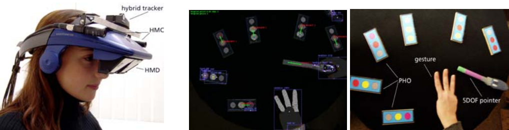
Figure 2 ARTHUR See-through HMD and CV-based recognition of PHOs, pointers, and finger gestures.

3. An AR framework supports the connection and communication of all these devices and links them to the actual architectural design, urban planning and simulation applications by an application interface. The framework supports multiple users, ensuring that all participating users see identical virtual objects on the table.