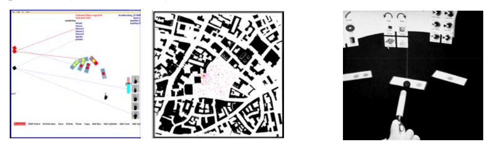
Figure 3 Linking the agent software in GRAIL (left). Interaction with CAD menus in ARTHUR (right)

The ARTHUR system has integrated a major CAD system (MicroStation) 5. enabling architects and engineers to directly create and manipulate a virtual (CAD) model during design and review sessions. The virtual model is displayed on top of the Augmented Round Table using the head mounted displays. By using a 3D pointer or finger gestures, the users are able to draw directly in the (augmented) real world, without having to use a separate CAD workstation. Virtual menus floating above the Augmented Round Table allow CAD tools to be selected, e.g. drawing b-spline curves, spheres and tori, as well as extruding surfaces and changing colors. After selecting a tool users are able to draw the appropriate objects in 3D space. Additionally, the users are able to move and delete objects The virtual menus are bound to placeholder objects (Figure 3 right) and therefore can be moved around on the table to get them into the view or move them out of the view to enlarge the working space. The system architecture will allow all tools and functionality of the CAD software to be integrated into the ARTHUR system, e.g. solid modelling, constraint solving, etc. As such, 'full fidelity' CAD models are created and interactively displayed by the system; there are no translation or conversion issues and the CAD models can be used directly in downstream design processes (Broll et al, 2004).