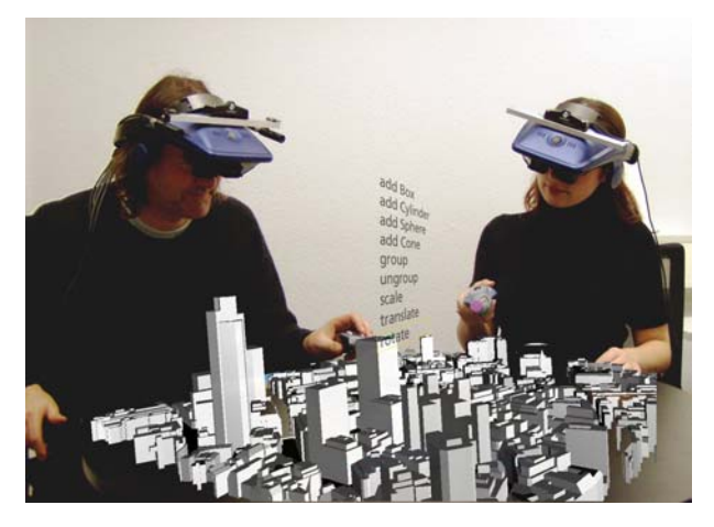
Figure 1 Collaboration within the ARTHUR environment

We present our approach ARTHUR, which integrates form creation with the simulation of functional performance, such as the simulation of pedestrian movement, as an important component of the collaborative design table. ARTHUR uses optical augmentation and wireless computer-vision (CV) based trackers to support collaboration within the 3D environment (Figure 1). Computer Vision techniques take input from stereo Head-Mounted Cameras (HMCs) and a fixed camera, to track the movements of placeholders on the table and the user's hand gestures. Virtual objects are displayed using stereoscopic visualization to seamlessly integrate them into the physical environment. Moreover, and unlike most AR systems, complex geometry can be directly created within ARTHUR using the integrated CAD system (MicroStation), which supports more advanced functionality such as 3D sketching and complex solid modelling.