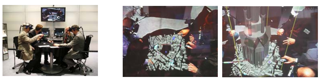
Figure 4 Multi user interactions and play with the church scale - CeBit 2004

All in all, the CeBIT test runs were highly successful. They provided not only valuable feedback on shortcomings, more importantly they verified the approach and the direction taken in developing ARTHUR. Most users quickly got into using the system and were then happy and willing to play with it and - on several occasions – test its limits (many users managed to scale the example church to several times its original size and seemed to enjoy the resulting dwarfing of the cityscape) (Figure 4).