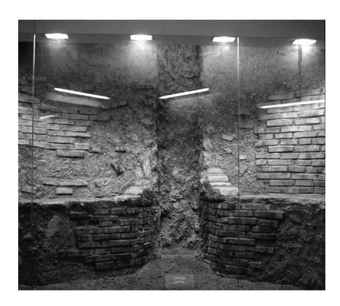
Fig. 5: Ancient kiln preserved in situ , 'Evangelismos Metro Station', Athens (Hellenic Ministry of Foreign Affairs 2005: http://www.mfa.gr/).