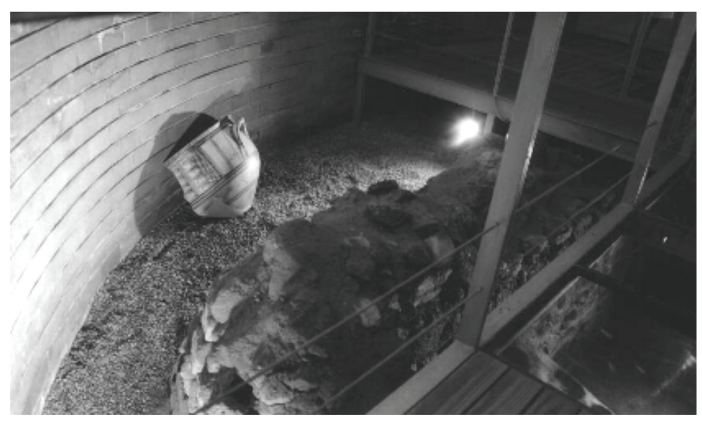
Fig. 8: Mycenaean ceramic workshop, Naxos, Greece (photo: K. Fouseki, August 2004)