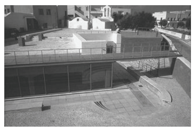
Fig.6: Archaeological 'in situ museum' of Naxos, Greece (Hellenic Ministry of Culture 2001b:www.culture.gr)