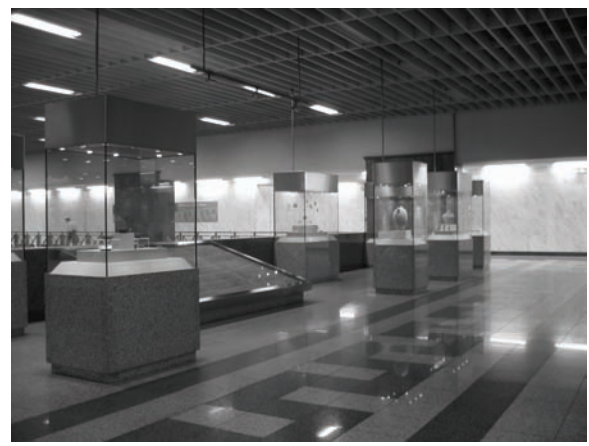
Fig. 4: Display showcases, 'Syntagma Metro Station', Athens (photo: K. Fouseki, September 2004)