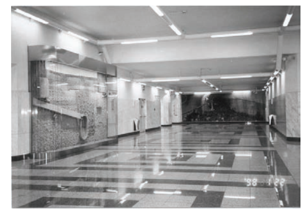
Fig. 3: Reconstruction of the stratigraphy of the ancient road I, 'Acropolis Metro Station', Athens (photo: K. Fouseki, February 2004)