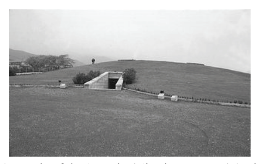
Fig. 1 Facade of the 'Vergina' 'in situ museum'

ΧΡΙΣΤΟΔΟΥΛΑΚΟΣ, Γ. (1993) Προβλήματα προστασίας και ανάδειξης ανασκαφών μέσα στη σύγχρονη πόλη: παράδειγμα τα Χανιά. ΙΝ: ICOMOS, (International Council on Monuments and Sites) ed., Νέες πόλεις πάνω σε παλιές, Επιστημονικό Συνέδριο στη Ρόδο, 27-30 Σεπτεμβρίου 1993, Αθήνα, Επτάλοφος, 471-3.