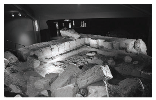
Fig. 2: Interior view of the collapsed 'heroon', Vergina, North Greece