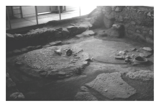
Fig. 7: Offering funeral tables, Naxos, Greece (photo: K. Fouseki, August 2004)