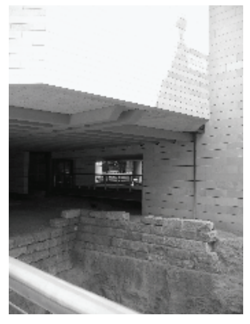
Fig. 9: Part of the fortification in the basement of National Bank, Aiolou street, Athens