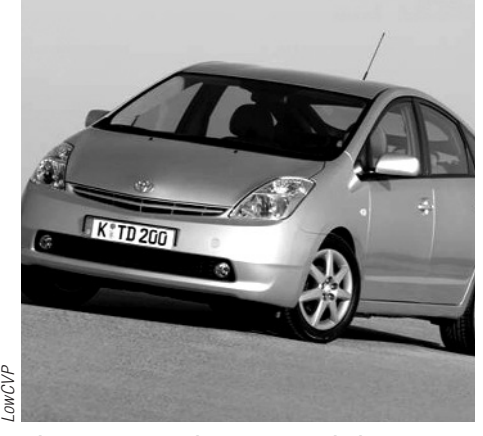
The Toyota Prius – low-emission vehicles are critical to the lower-carbon future, but are reliant on technological improvements and changes in consumer buying preferences

The behavioural-technological dichotomy is perhaps too simplistic – both fields are hugely interlinked. To move all fleet average emissions towards the standards of the Prius will mean that everyday car usage in the future is not made in the current highly sought-after vehicles. Even the supposed technological 'silver bullet' requires change to individual behaviour and individual consumer choice. The Prius sold about 3,500 vehicles in 2005 (and is priced at over £17,000 – too high