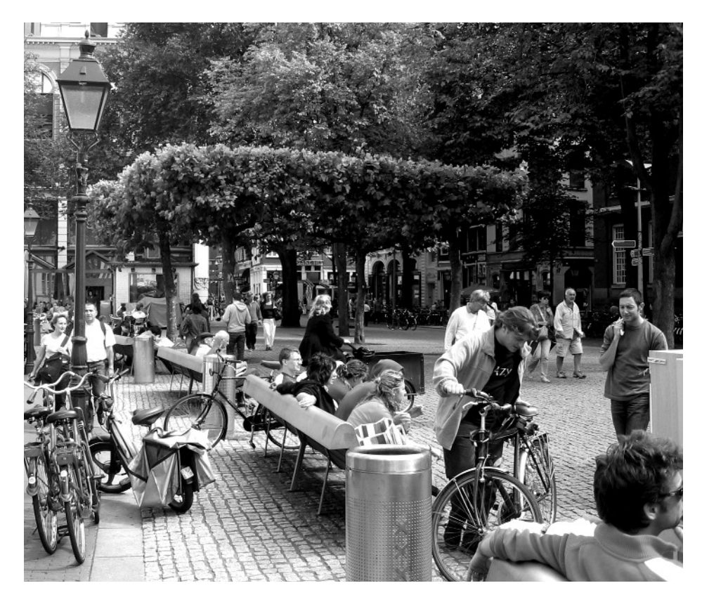
We need to raise our collective game – state-of-the-art walking, cycling and public transport networks are required, integrated with a radically enhanced quality of life in urban areas

is our investment strategies now that are likely to make (or at the moment more likely not to make ) the difference in future years. We are, it seems, hopelessly complacent in accepting and perpetuating our car-dependent lifestyles. Surely we can raise our collective game?