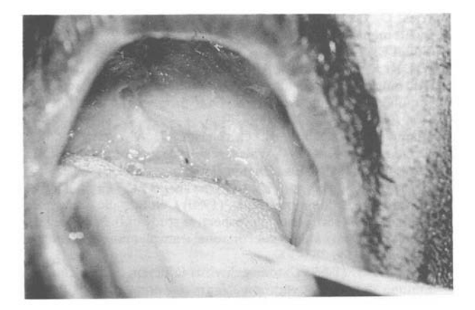
FIG. 3 Case 3 showing linear deep palatal ulceration.

oped PCP in February 1989 and lingual herpes simplex infection in March 1989 both of which responded to treatment. He later developed two lesions of Kaposi's sarcoma on his right upper arm.