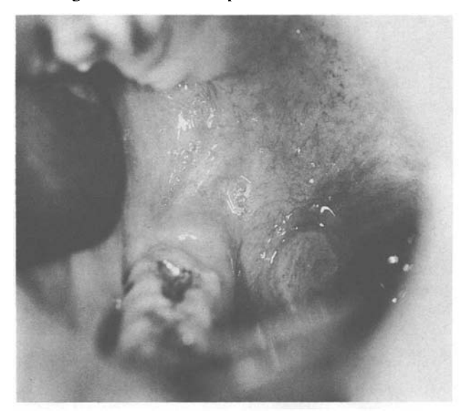
FIG. 1 Case 1 showing an ulcer on the tonsil and anterior pillar of the fauces.

He was diagnosed HIV1 antibody positive in November 1988. He had secondary syphilis treated in 1979 and had single dermatomal Herpes zoster in 1982. He devel-