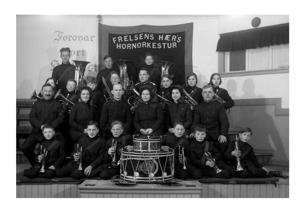
Plate 1: Salvation Army Young People's Band, Tórshavn, c.1933

The photograph shown here (Plate 1) depicts a particularly striking example of language synergy. The picture, which has not been previously analysed, shows a Salvation Army young people's band from Tórshavn, c.1933. The flag in the background displays an interesting language mix: Da. Frelsens Hær ("The Salvation Army") instead of Fa. Frelsunarherurin , coupled with Fa. hornorkestur ("brass band"), rather than Da. hornorkester . <sup>141</sup>