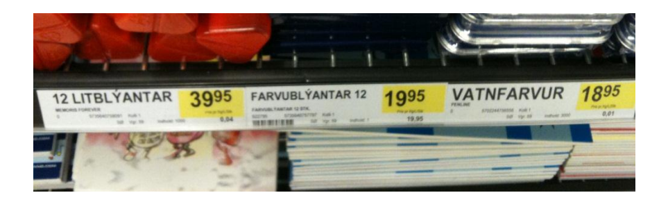
Plate A1: Shelf-edge Labelling

Plate A1 shows a Danish loanword (in Faroese sprogdragt ) side-by-side with the recommended term. This example demonstrates how, with little effort, the Faroese are able to utilise Danish loanwords and reduce the amount of Danish that needs to be read. Here, the recommended term litblyantar ("colouring pencils") is depicted next to a Danish-based form, farvublyantar (Da. farveblyanter ).