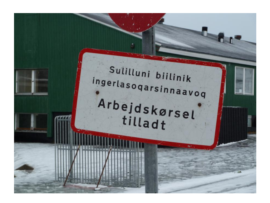
Plate A2: Bilingual Signpost in Greenland

While most signs give the two languages equal prominence, on this one the Greenlandic words are considerably smaller than the Danish equivalent.