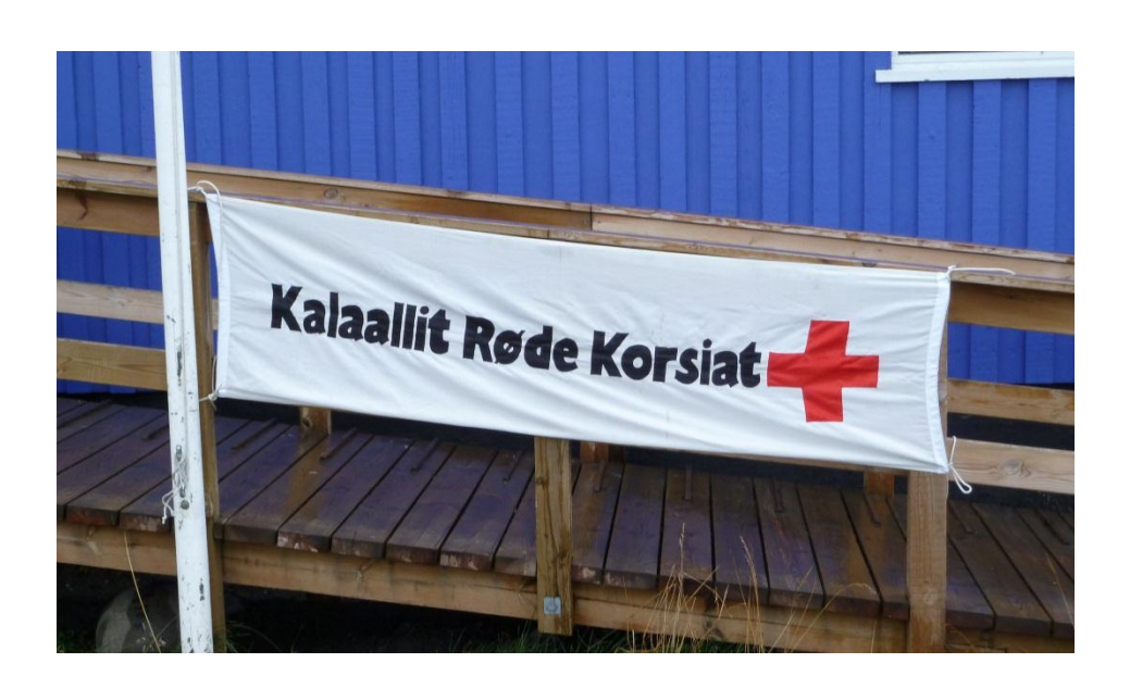
Plate 2: Greenlandic Red Cross Sign, Nuuk, 2010.

The question of loanwords and purism leads to an interesting point of comparison with the Faroes: the use of Danish words in Danish form (often with the additional -i) side-by-side with Greenlandic resembles the synergetic written codeswitching seen in the Faroes during L. Joensen's 'Dano-Faroese moment' (3.5.1, point 3.). Plate 2 largely resembles Plate 1, which depicted the Salvation Army flag (see previous reference). In this case, the sign for the Greenlandic Red Cross combines Greenlandic ('Kalaallit', "Greenlandic') with Danish ('Røde Kors', "Red Cross'). While 'kors' has been (minimally) adapted to Greenlandic, 'røde' has not: it even contains the Danish definite adjective marker -e (from Da. r\phi d 'red'). As discussed in the Faroese analysis, this type of bilingual writing would not be acceptable in the Faroes today, yet it is still found in Greenland. Without greater analysis of the Greenlandic situation, firm conclusions on the situation there cannot be drawn, but on the evidence thus far, it could be argued that there is also a 'Dano-Greenlandic moment': unlike in the Faroes, however, this moment has not yet come to an end.