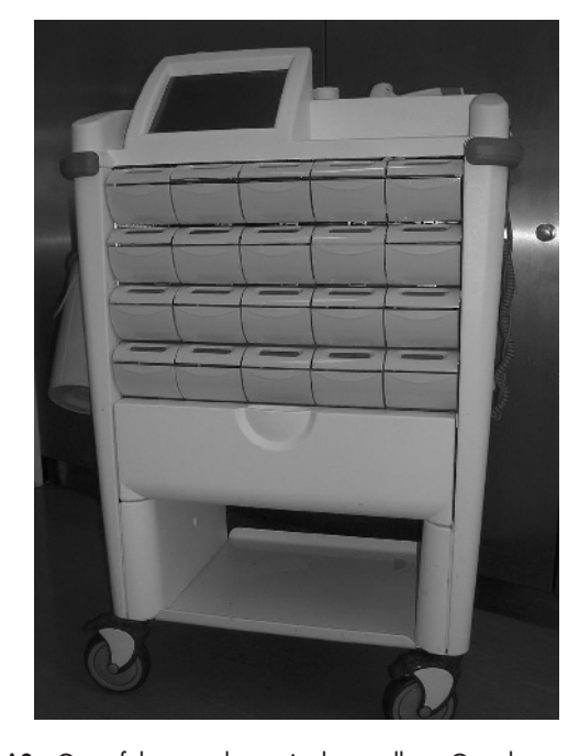
Figure A3 One of the two electronic drug trolleys. One drawer is allocated to each patient for whom medication is due and their name shown on the liquid crystal display. The barcode scanner is on the top of the trolley.

Medication prescribed "to be given when required" was generally given separately outside the main drug rounds.