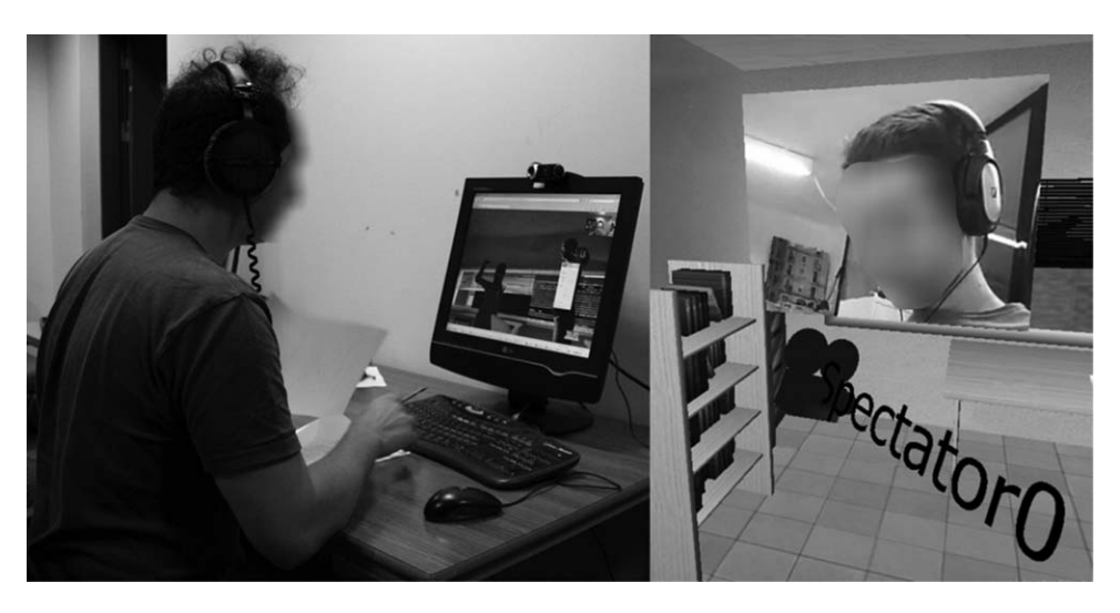
Figure 3. Director/spectator setup. Left-hand side: A simple desktop/laptop computer is required. Right hand side: Representation of the director in the SVE. A 3D camera represents position and viewing direction, with live video from the web camera displayed on top.

The director could view and intervene through a desktop system together with a webcam (see Figure 3). The director saw the scene with the two actors displayed on a desktop PC, and could navigate the 3D reconstruction