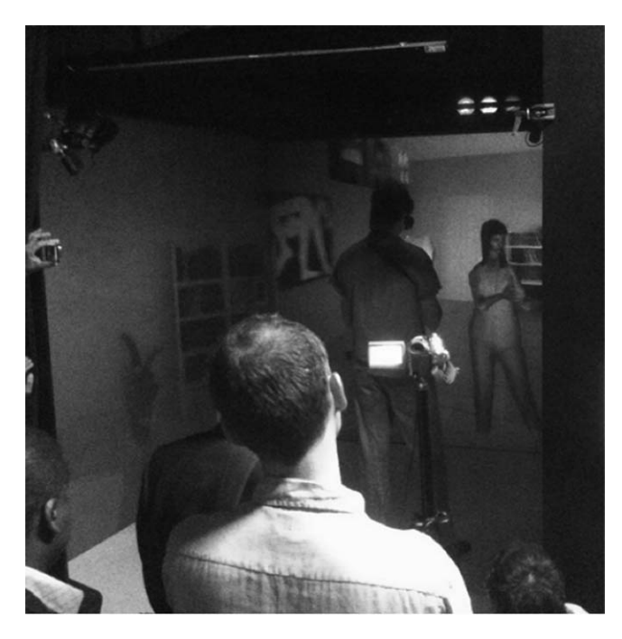
Figure 5. Illustration of the rehearsal. M is in the Cave while we can see K's avatar displayed stereoscopically on the wall.

and gestural movements, and taking care of overall blocking and timing considerations.