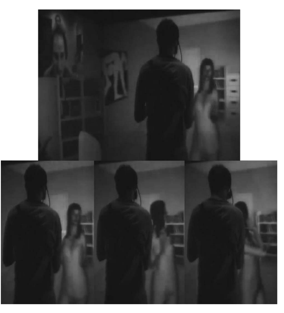
Figure 6. Top: E is directing the actors; he asked K to turn around. Bottom left to right: the actress is turning around following the director. NB: These pictures are taken from the video available on YouTube and were taken during the rehearsal in the Cave system. As a consequence, the pictures seem blurred because the Cave system uses a double rendering needed for stereoscopy.

whole body interaction is the key feature of the system. Indeed, he said that he first thought that " if you do not have the actual person's [facial] expressions you are not going to be able to really play the scene for what it is worth, but I was really shocked and taken aback" by the fact that "you can [play the scene for what it is worth] and it is really an interesting technology to be developed."