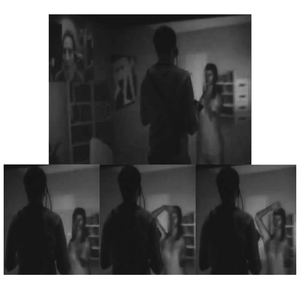
Figure 7. Top image: E is directing the actors. He tells K to put the back of her hand to her forehead in order to emphasize the dialogue. Bottom left to right: Movement of K's right hand in order to follow the director's request. As in Figure 6, the images appear blurred because of the Cave's stereoscopic rendering system.

stressed the importance of the full body motion: "the fact that when you move the virtual body moves correspondingly gives you the sensation of actually interacting in this virtual space." Moreover, "seeing the virtual representation of M moving and interpreting the play not only verbally but also using gestures enhances the sensation of being there with him." She pointed out some problems related to the tracking of M's IK movements "there were moments when M's movements were somehow lost, this broke a little bit the whole atmosphere," but said that "during most of the time I did have the sensation of being inside the same room." Finally, she emphasized the importance of knowing the location of M during the rehearsal: "knowing his location was absolutely essential! Especially because the whole performance is based essentially on body movements, gestures,