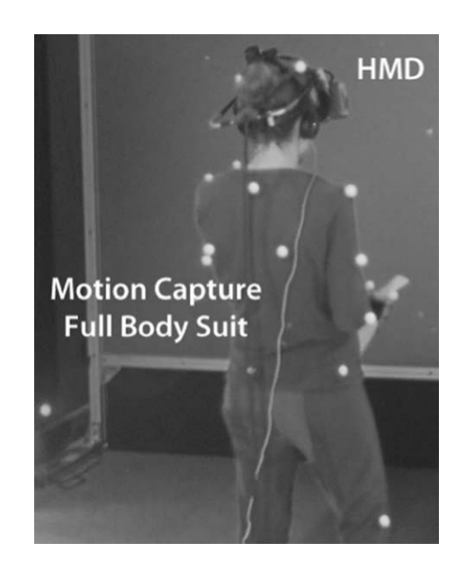
Figure 1. Full body motion setup: the actor wears an HMD and a motion capture suit.

Motion tracking was achieved by a 12-camera Optitrack infrared system that tracks reflective markers attached to a tight-fitting motion capture suit worn by the actor (see