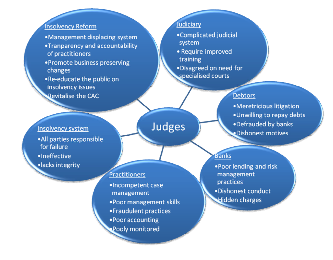
Figure 4: Summary of opinions of judges