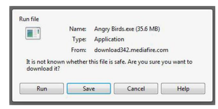
Fig. 6. Opera's warning text in a download dialog box.

file is safe. Are you sure you want to download it?" (Fig. 6). By using the passive rather than the active voice ("it is not known" vs. "we don't know"), it takes away the focus from the browser not being able to check the file for malicious elements to the user who has to be sure about the download.