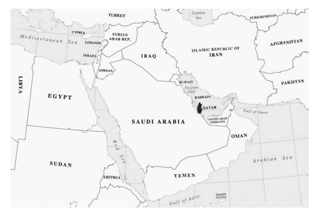
Figure 1 Map showing the location of Qatar in the Middle East.