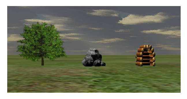
Fig. 1. Types of landmarks (trees, rocks, wood pile).

In worlds with 3 landmarks, all 3 were of the same type. Worlds with 9 landmarks contained 3 of each type. The positions of the landmarks, and which of those should be designated the target were pseudorandomly generated. The landmark type for the trials with 3 landmarks was also pseudorandom, as was the landmark target type in the trials with 9 landmarks.