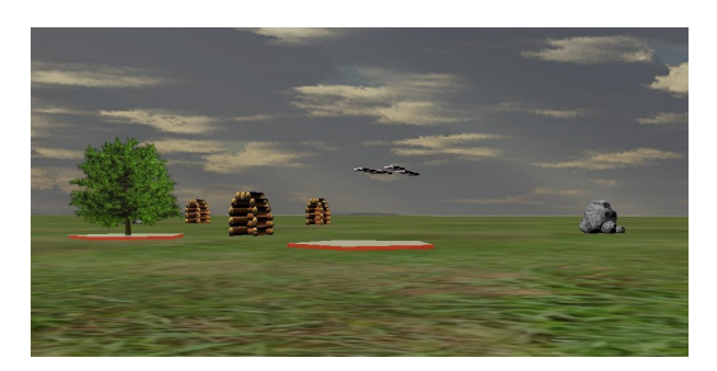
Fig. 2. False shadows

work of [15] As illustrated in Figure 2, these were graphical regions projected onto the ground.