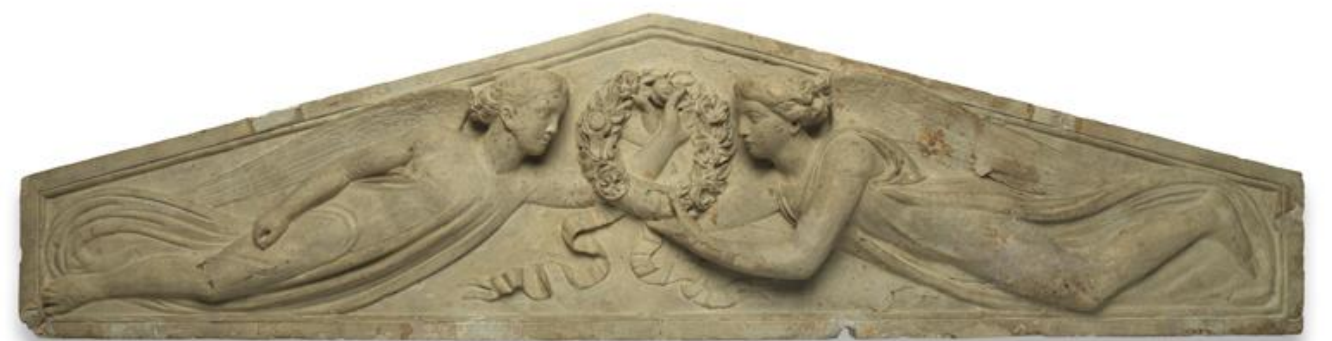
John Flaxman's plaster for a Monument to Henry Temple, 2nd Viscount Palmerston and Mary, his 2nd Wife, 1847.

The materials are made available under Creative Commons open access licences, widening the potential reuses of these primary research materials on ancient Greece.