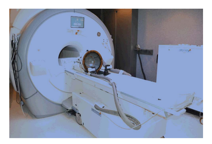
Figure 2 Commercially available magnetic resonance-guided (MR-quided) focused ultrasound.<sup>10</sup>

The main advantage of SRS is that deep-seated and multiple lesions can be treated without any surgical approach, avoiding