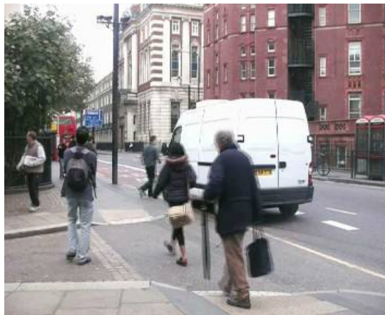
Figure 1: Crime clip (theft from rucksack)

Participants were asked specifically to pick a scenario instead of giving an open-ended response so that performance could be objectively measured.