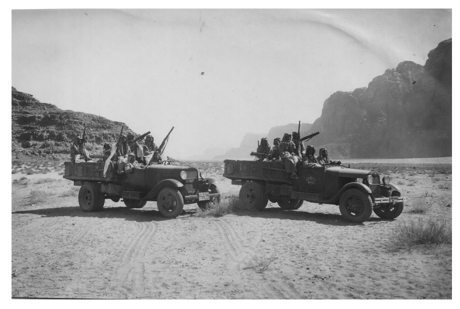
Figure 3. Desert Patrol Cars.