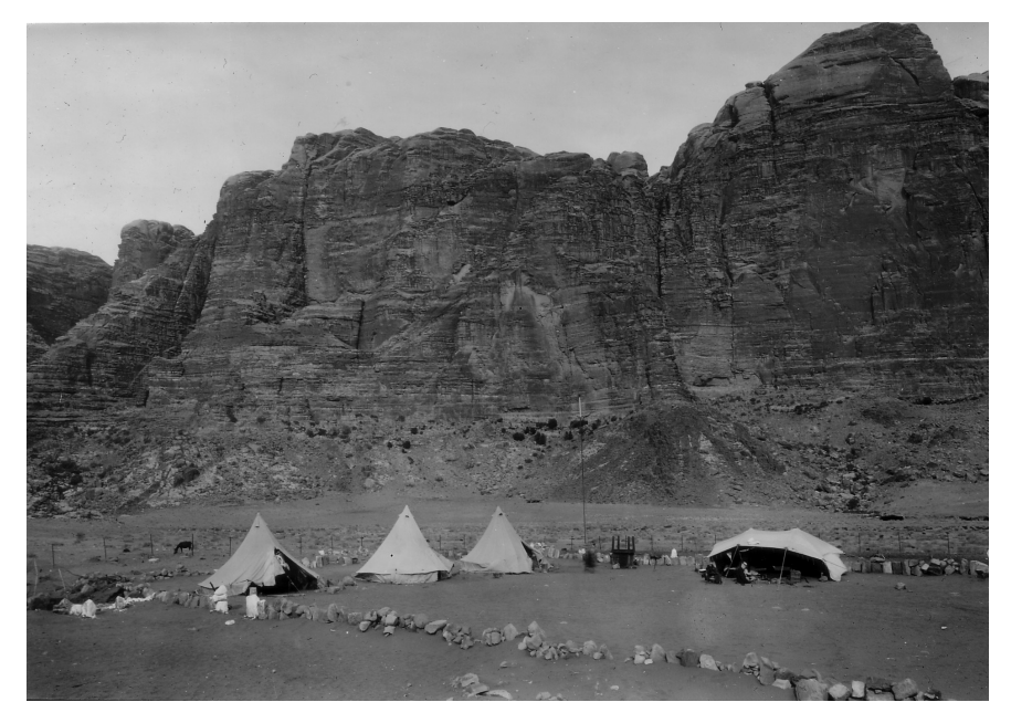
Figure 4. Jebel Rumm Police Posts, 1932.