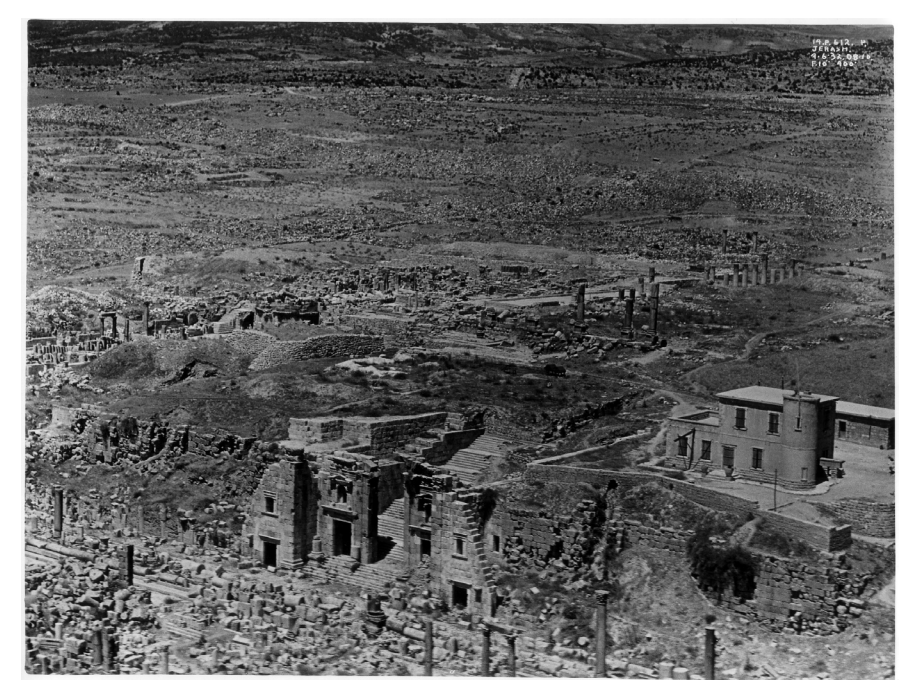
Figure 2. Aerial photo, Jerash.

The Horsfields used Desert Patrol posts as stopping places on their journeys to various sites. In 1932 during their journey to Kilwa, the site of a Nabataean village that