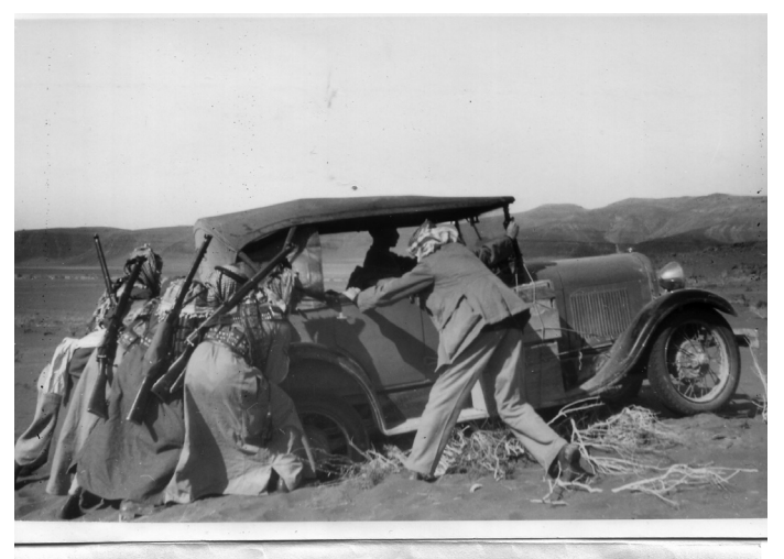
4. Traffic difficulties in the Transjordan desert Figure 5. Traffic Difficulties.

The Horsfield collection also constitutes a photographic record of some of their excavations and surveys. The excavations at Wadi Rumm have been discussed above. The Horsfields' explorations at Kilwa, Transjordan (now part of Saudi Arabia) are part of the collection as well (P. Parr, pers. comm.). There are photographs of the rock-carvings that the Horsfields found at Kilwa which feature prominently in several of their articles. One image in particular, labeled "best ibex" (Fig. 6) on the photograph, shows a "wounded ibex with blood streaming from his mouth" (G. Horsfield et al. 1933: 385). Nelson Glueck, the Horsfields' companion on the Kilwa journey, describes the ibex as "faithfully and artistically rendered...the gracefulness and beauty of the delicate animal...have been caught and imprisoned in the lines on the stone..." (Glueck 1939: 420). Proper documentation of finds was clearly important, as archaeologists sought opinions on finds from other archaeologists, and used photographic evidence to back up their claims. The Horsfields' visit paved the way for a more intensive excavation conducted by a team of German archaeologists led by Leo Frobenius at the site two years later (Glueck 1939: 417).