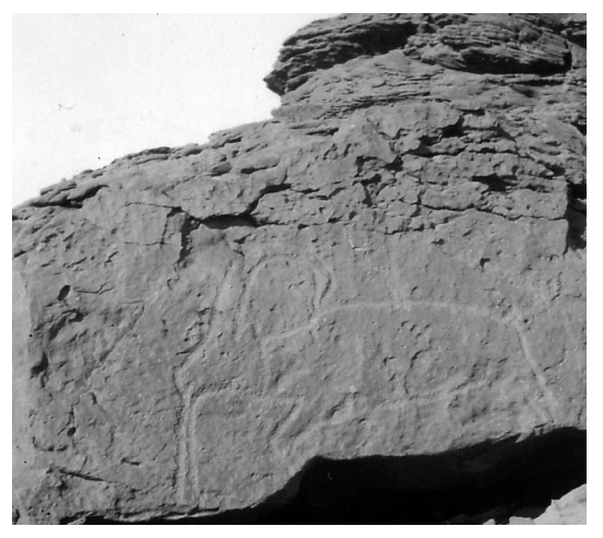
Figure 6. Kilwa, Best Ibex.

The Horsfield collection demonstrates the complex social and political world of British Mandate territory in the 1930s. The British helped to establish the royal families of Jordan and Iraq in the early 1920s whilst maintaining administrative and military control over the area. The British military presence in Iraq at this moment is trying to help establish an administrative and governmental system in the wake of the previous government's destruction. However, in another sense, there is again an occupying military force in the area, one not necessarily welcomed by all of the communities and peoples who live there. The 2003 looting of the Iraq Museum, initially created by Brit-