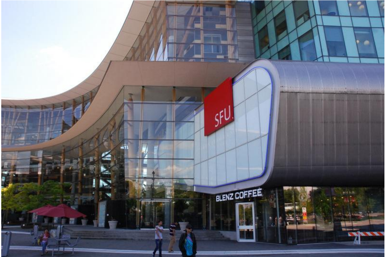
FIGURE 2: Simon Fraser University's (SFU) satellite Surrey Campus (pictured) opened at the centre of the booming suburban municipality of Surrey, BC with an enrolment of 565 students in 2002. SFU's Surrey campus represents a refocusing of the University's institutional footprint, spatial imaginary and investment into the metropolitan periphery. Illustrative of how universities, through distinct reterritorialization strategies, can respond to, and actively reshape, new urban structures, SFU's Surrey campus has expanded to incorporate new classrooms and science labs while supporting intensified development around Surrey's Central City complex (including residential and office tower construction) over its first decade of operation.