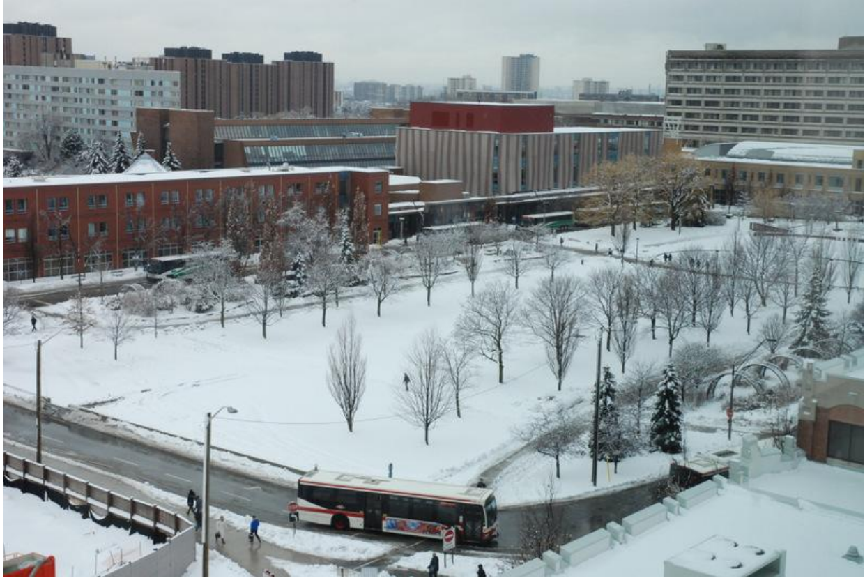
FIGURE 1: York University's Keele Campus opened in 1965 on the outskirts of the Municipality of Metropolitan Toronto but decades of urban growth mean the suburban campus is now located at the center of the Toronto city-region. The Province of Ontario's growth management and transportation plans, released between 2004 and 2008, position York University as a major regional "mobility hub" integrating diverse transit services across the Greater Toronto Area. The Keele Campus already functions as a key terminus for local, express and regional bus service while a subway connection to downtown Toronto and Vaughan Metropolitan Centre (with a station currently under construction in the bottom left of the image) is expected to open in 2016 (photo by Roger Keil).