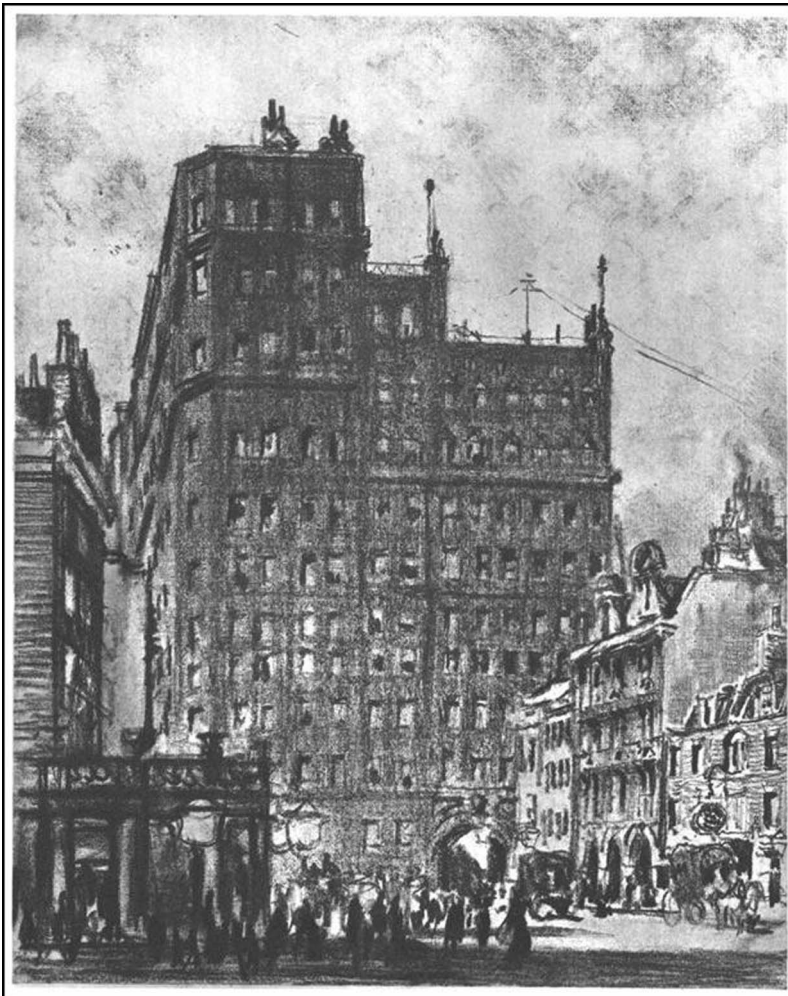
FIGURE 3 Joseph Pennell, 'Queen Anne's Mansions', c.1904, originally in Henry James, English Hours (1905), reprinted in J.C. Squire (ed.), A London Reverie (1928)

'not 10 minutes from all the clubs, combining the advantages of a private house, the freedom of an hotel, and the luxury of a club'. For visitors to London, 'It is close to Piccadilly, Bond Street, and the West-End Theatres; also to the Houses of Parliament, Westminster Abbey, and the new Roman Catholic Cathedral', and less than 15 minutes from the City by underground train. 41 In these respects, the mansions matched New York apartment-hotels like the Ansonia which also offered a combination of private apartments, full service and a relatively central location. 42