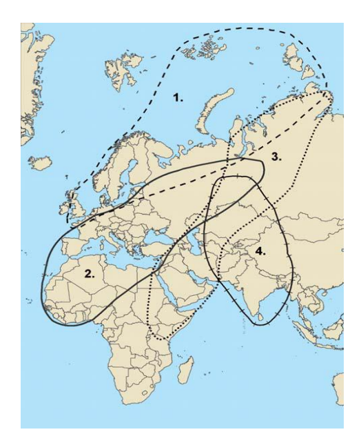
Figure 1. Main geographical populations of Anatidae in western Eurasia: 1. Northern White Sea/North Sea population; 2. European Siberia/Black Sea-Mediterranean population; 3. West Siberian/Caspian/Nile population; and 4. Siberian-Kazakhstan/Pakistan-India population (Isakov 1966).