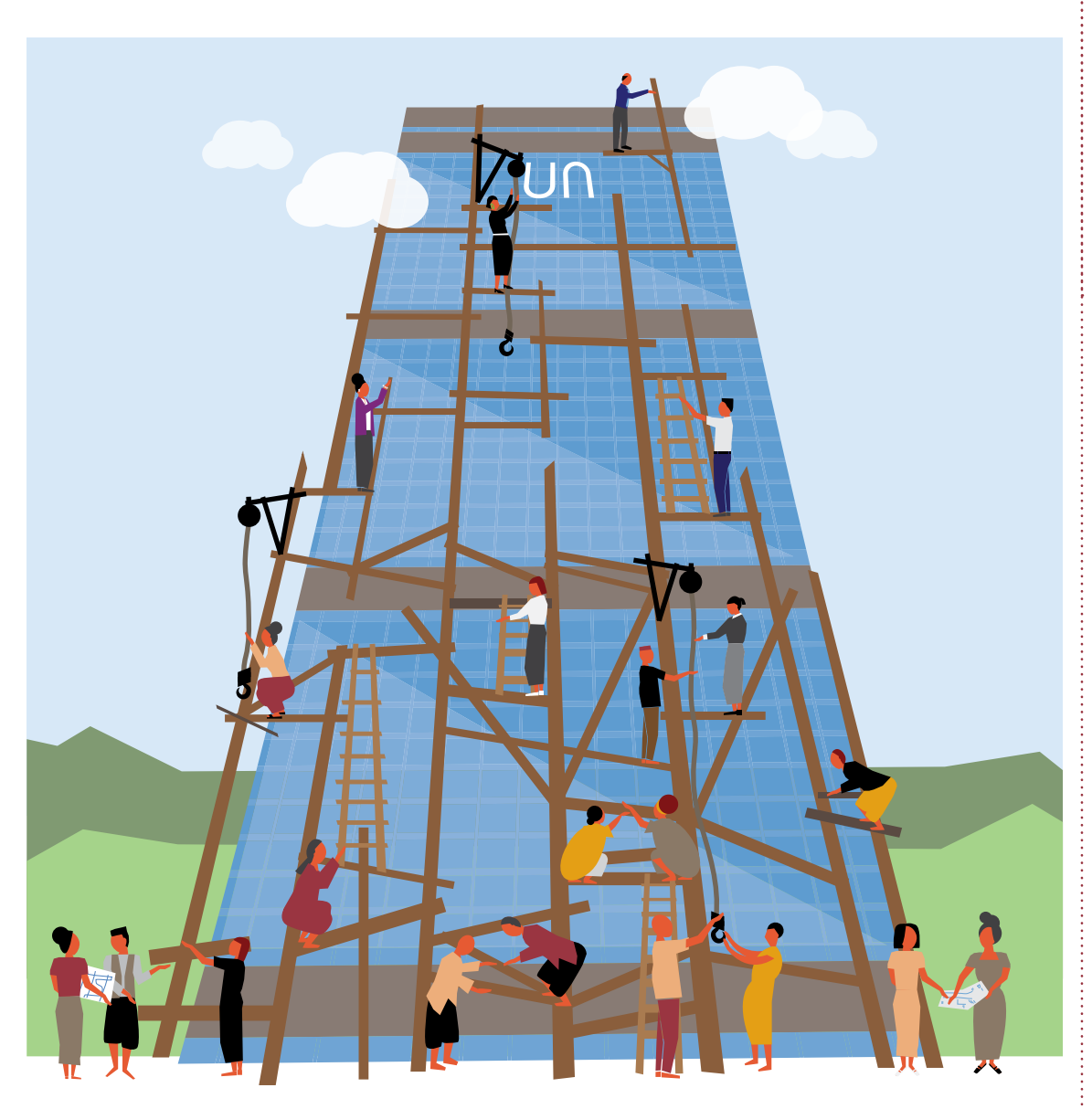
Diagram 3: Scaffolding the policy process

Reflecting on whether we were successful in achieving what we aimed to set out to do: it is probably too early to tell. We were successful in getting local messages synthesised to the global level, and this has had some influence on the outcomes of the post-2015 debate. @