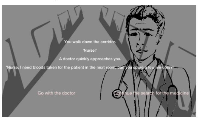
Figure 1: Medical Student Errors