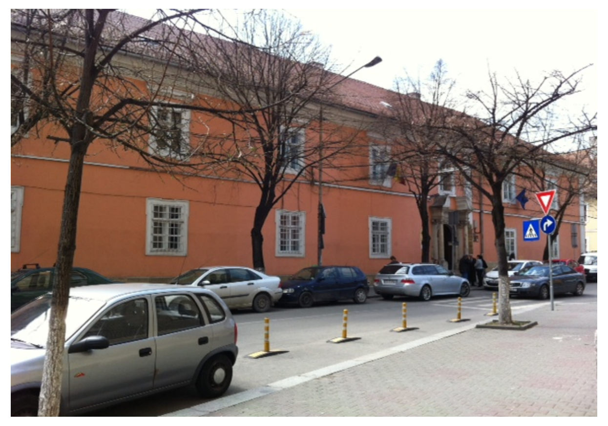
The former Jesuit College, Cluj.