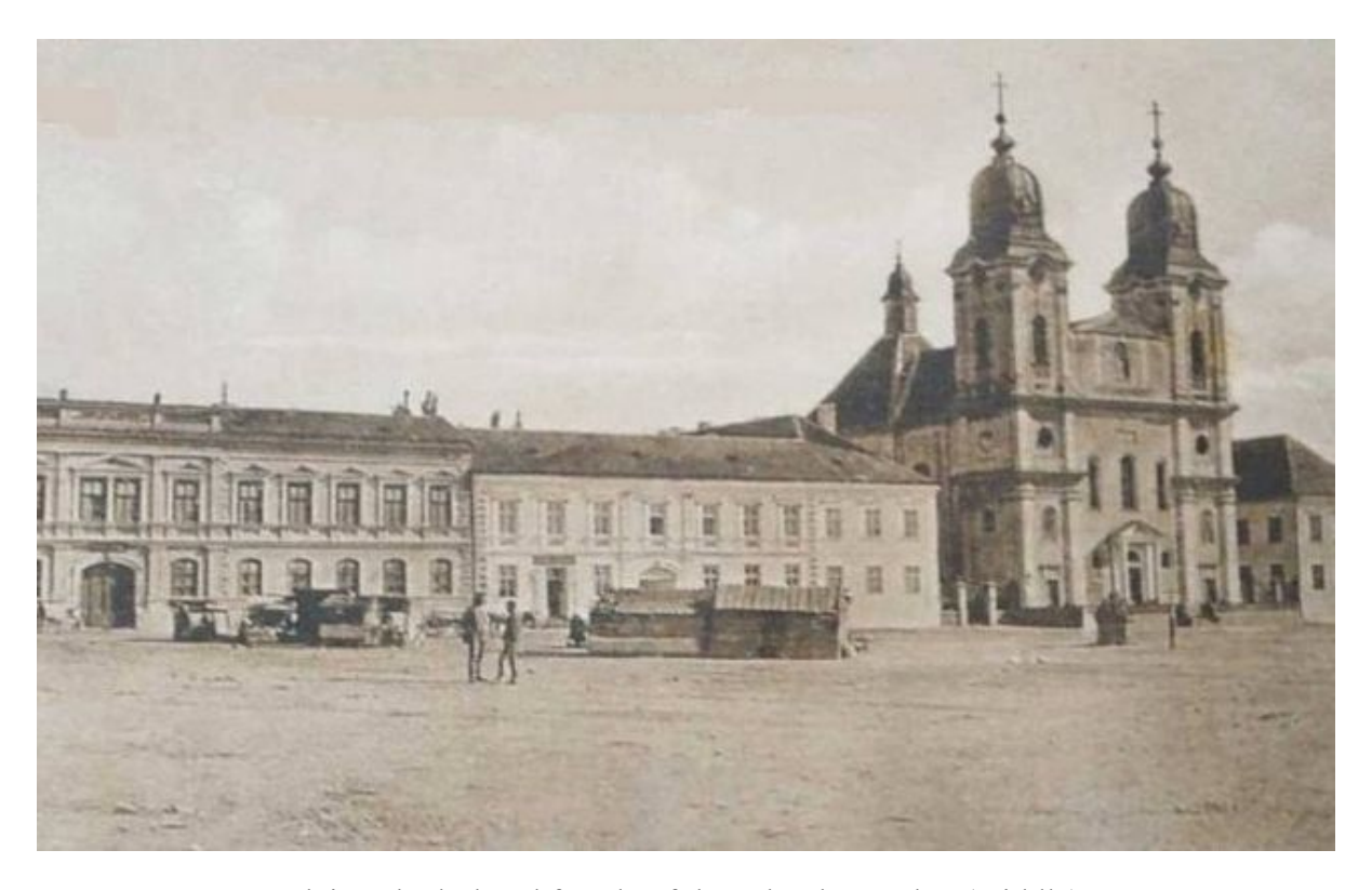
Blaj Cathedral and façade of the school complex (middle).