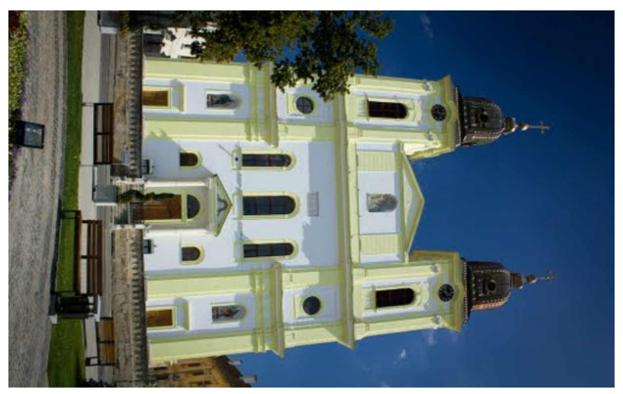
The former Jesuit Church in Cluj, now the Piarist Church.