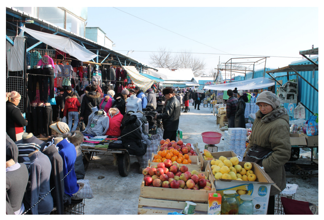
Fig. 2: The excavation at Taraz city was located in the bustling heart of the central market.

Talas valley, dates to 568 AD (Baipakov et al. , 2011: 282). Thereafter the city is frequently mentioned in both Arabic and Chinese sources as a major settlement, and its size and significance is undoubtedly attributable to its location between the Talas and Asa rivers on a major Silk Road route between Otrar and Balasagun (Moldakynov, 2010: 10; Baipakov et al. , 2011: 254–255).