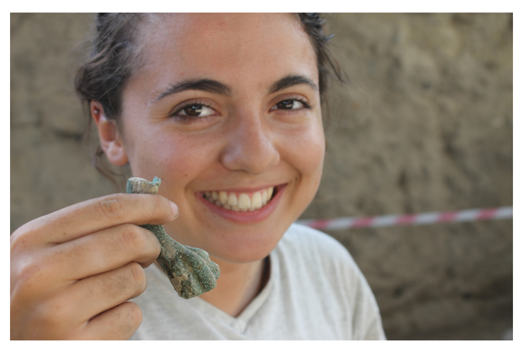
Fig. 11: A notable find at Taraz was a copper-alloy animal paw, from one of the numerous refuse pits