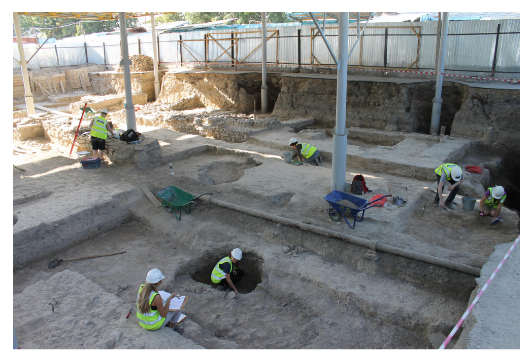
Fig. 4: UCL students excavating at Taraz under the purpose-built shelter.

Phase 3: 10th-12th centuries; Building 3 After the demolition of Buildings 1 and 2, a large stone building (Building 3) was constructed in this area of the citadel (Fig. 5). Building 3 was built in an entirely different manner with split-stone blocks faces and a river-rolled stone cobble core. No contemporary internal walls or floor surfaces survived, and there was no indication of the building's function, although immediately to the north were three conjoined lengths of ceramic water pipe, suggesting that this building had access to running water. Similarly, the absence of large finds assemblages associated with Building 3 greatly restricted the dating of the structure, and the best estimate for its occupation, between the 10th and 12th centuries, is based on its stratigraphic position between the better-dated earlier and later buildings.