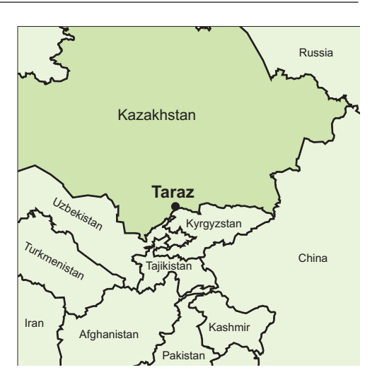
Fig. 1: Location of Taraz in Central Asia.

The aim of the 2011–2012 excavation in the central market in Taraz city (Figs 1 and 2 ), undertaken as a joint venture between Archaeological Expertise (AE), Kazakhstan, and the Centre for Applied Archaeology (CAA) of the UCL Institute of Archaeology, was to identify remains worthy of in situ preservation and conservation, which could be displayed as a permanently covered archaeological exhibition in the city centre. The excavation was only one element of the overall initiative, with education and public outreach also important parts (Fig. 3). The ultimate intention of the joint venture is to assist in developing tourism initiatives based on archaeological resources of the city, and to raise awareness, amongst the local population, of the significance of local heritage, and its protection and management.