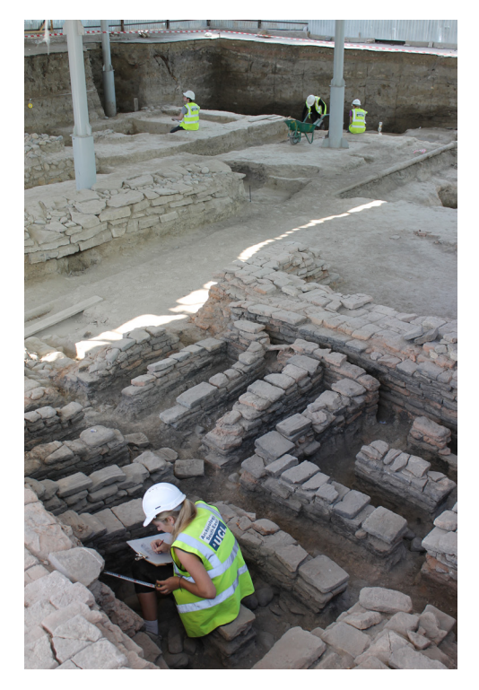
Fig. 9: The brick-by-brick recording of the hamam bathhouse (Building 4).

The similarities between Rooms A and D suggest they may have had a similar function