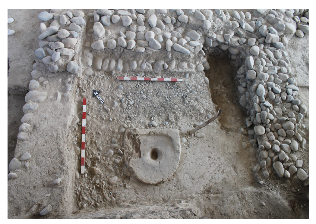
Fig. 7: The flame shrine in Room B of Building 1.