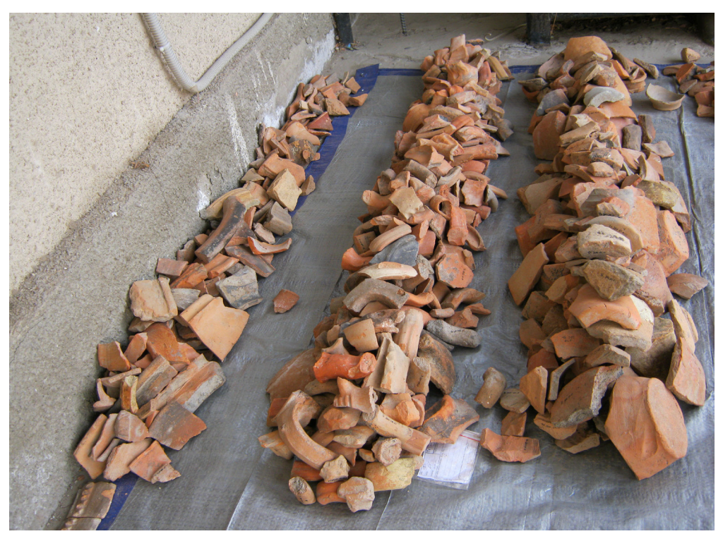
Fig. 10: Part of the exceptionally large ceramic assemblage from the Taraz excavation.