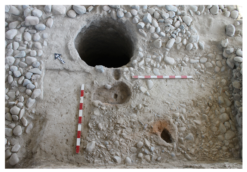
Fig. 8: The workshop (Room C ) of Building 1, with three small furnaces.