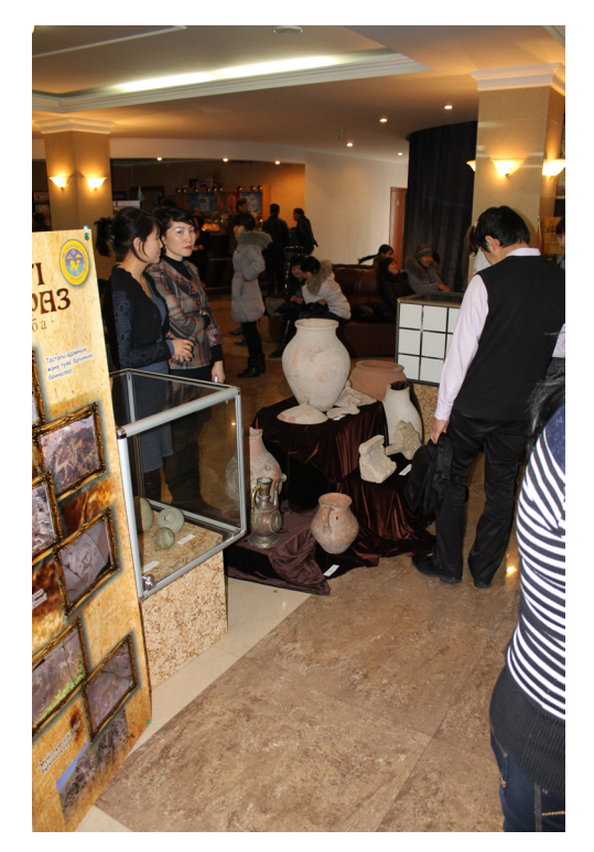
Fig. 3: Public outreach is an important part of the Taraz project and the site has attracted a great deal of media interest both in Kazakhstan and further afield.