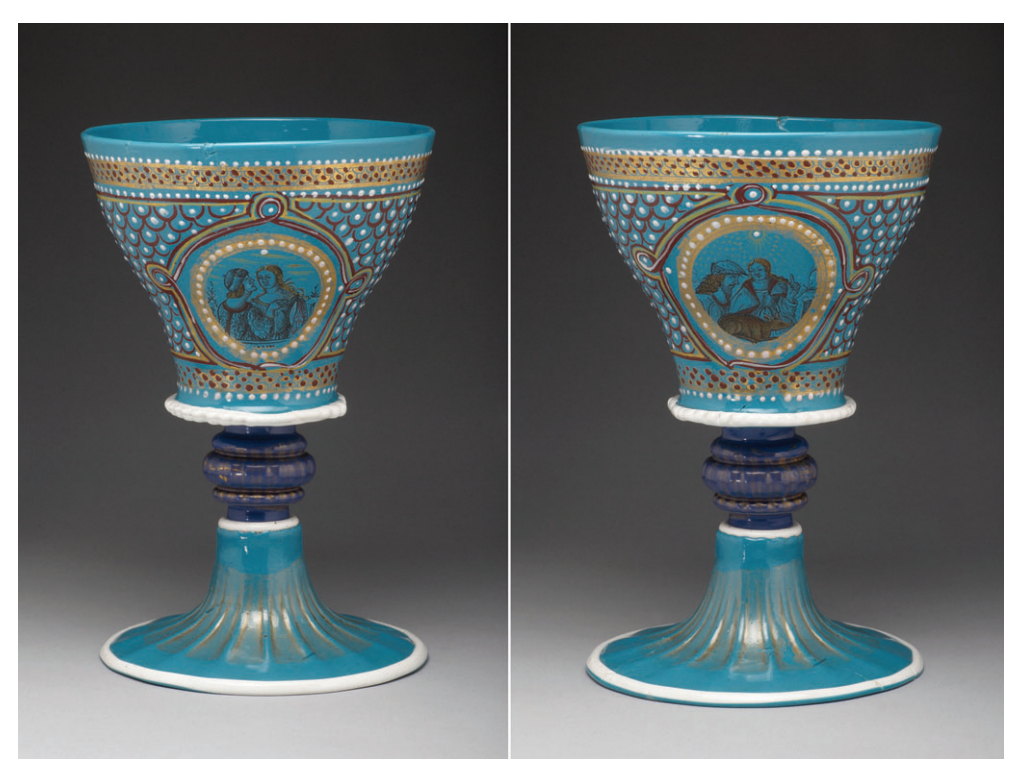
Figure 1. The Waddesdon goblet (British Museum WB.55: height 18.9 cm)