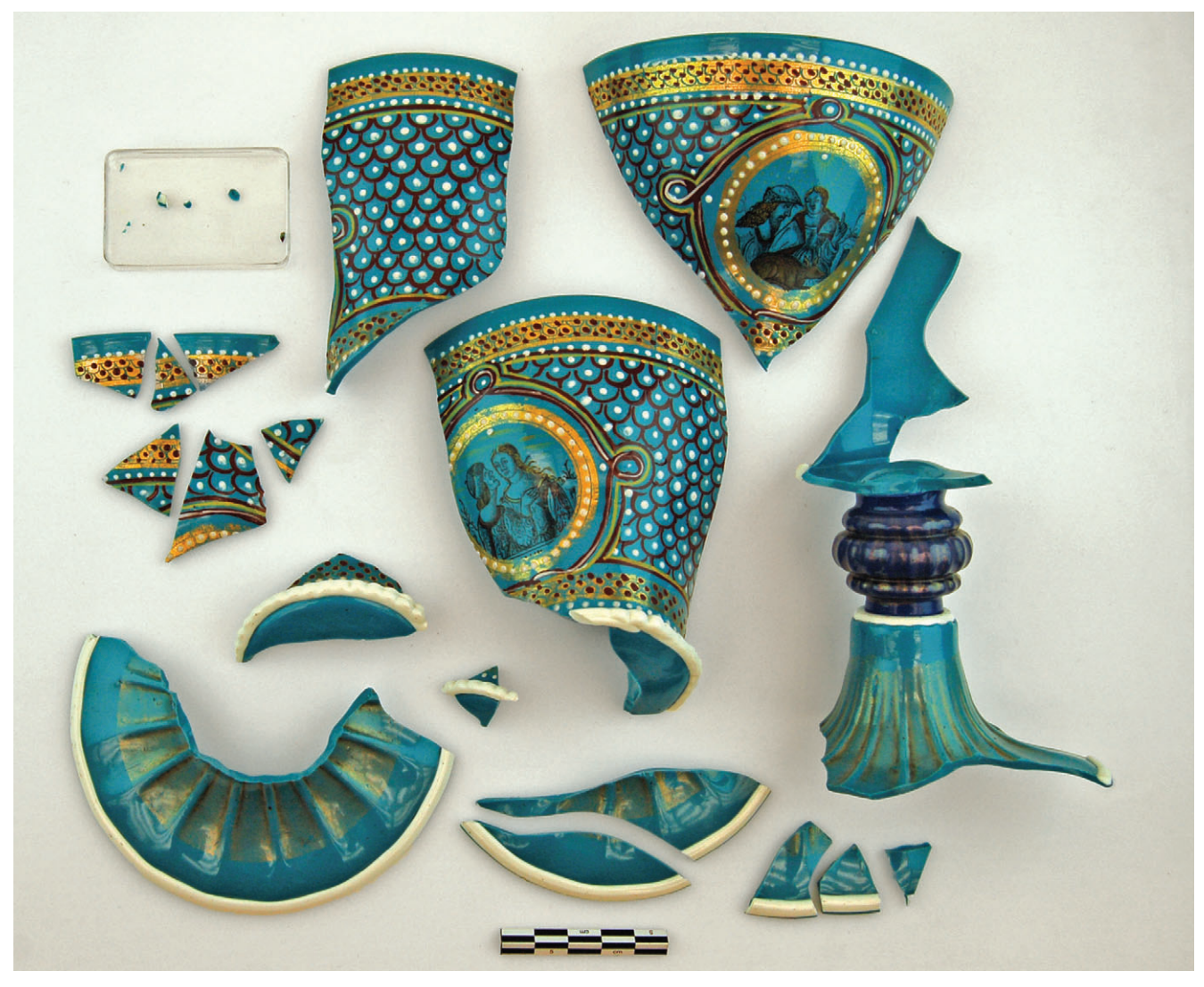
Figure 5. The Waddesdon goblet dismantled prior to reconstruction in 2014

it was probably made in the same workshop and enamelled by Obizzo [13]. The beaker is however very different, as it is made of a dichroic glass that changes colour by transmitted light from turquoise to deep red [14]; it is also much more crudely enamelled. It was clearly prized by the English family that once owned it, the Fairfaxes, as one of them referred to it as "the Ancient Cup of our Familye" in 1694 [15; p. 49].