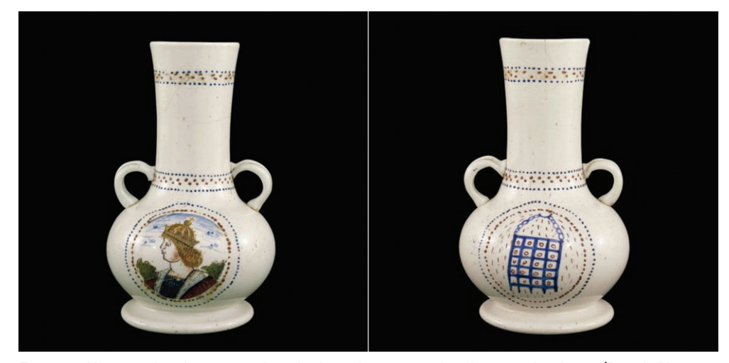
Figure 3. Vase made of opaque white lattimo glass painted with enamel colours (British Museum 1979,0401.1): left, the roundel on the front containing the bust of Henry VII; and right, roundel on the back containing a portcullis in blue and red