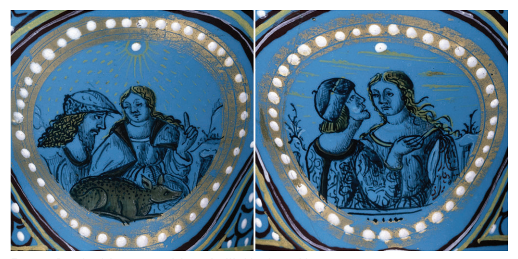
Figure 2. Details of the two roundels on the Waddesdon goblet

a different man, who is short-haired, clean-shaven and richly dressed in velvet brocade, faces the same woman in a low-cut gown with a belt and separate sleeves worn over a chemise, her flowing blonde hair picked out in yellow enamel and gilding, Figure 2: right. He gazes into her eyes and places his hand on her breast; they seem to be a betrothed or married couple in their wedding finery [2; pp. 55–56 and fig. 36]. The scenes appear to be part of a narrative – perhaps illustrating a poem or romance – as an allegory of love or chastity of the kind found on art made to commemorate marriage in Renaissance cities [2; pp. 66–67].