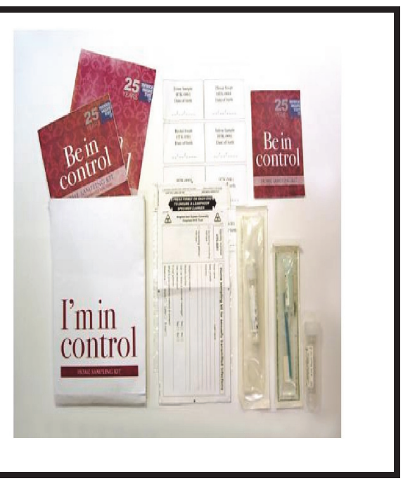
Fig 1. Contents of the home sampling kits.

Self-sampling information sheet Urine pot to collect urine sample Swabs to collect specimens from the throat and rectum Orasure® swab to collect saliva specimen from mouth 2 specimen transport tubes for storing the swab specimen Specimen request form Pre-numbered stickers for labelling the specimens Pre-numbered study questionnaire Pre-addressed envelope to return the study questionnaire Packaging to return the completed specimens