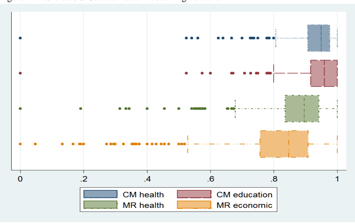
Figure 2: Interviewers' success rates in obtaining consent.

Figure 2 presents a boxplot depicting variations in success rates in obtaining consent among interviewers. The success rate is defined as the number of obtained consents divided by the number of completed interviews for each interviewer. The number of completed interviews varied between 2 and 86 while success rates varied between 0 and 100 percent. The figure shows that there are substantial variations in success rates among interviewers with a relatively large number of outliers. Success rates in obtaining consent are the most dispersed for the MR's economic consent followed by the MR's health consent. This perhaps reflects the fact that economic linkage is the most controversial among the four consents. Moreover, the bottom quartile of interviewers has the largest dispersions irrespective of the domain. It is also worth noting that all outliers belong to the lowest quartile. The existence of important variations between interviewers in terms of success in obtaining consent warrants the modelling of interviewer effects.