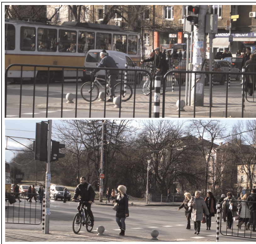
Figure 3. Tactics of crossing the Grafa and Evlogi junction, central Sofia.