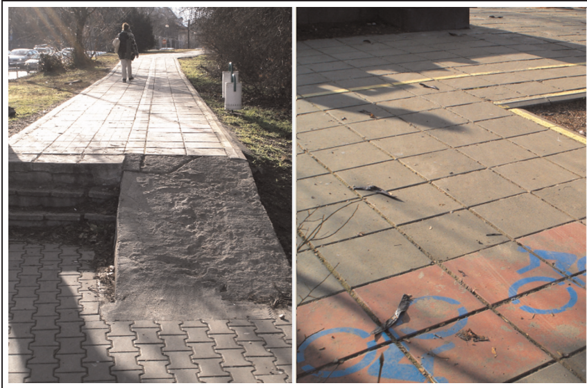
Figure 1. Cycle paths in central Sofia.