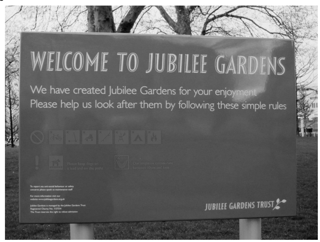
Figure 6. Use and access rules set out by managing Trust in Jubilee Gardens.