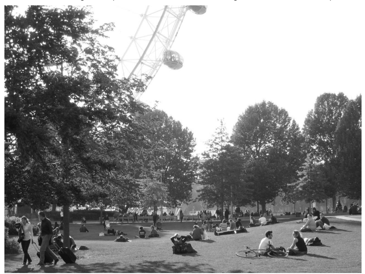
Figure 11. Jubilee Gardens. The 'publicness' of the spaces is not visibly affected by contracted-out management.

removal, building repairs, etc., which are part and parcel of the day-to-day working of the local authority. Publicness outcomes in this case depend on how the narrow focus of the arrangements relate to the broader range of aspirations and interests that might be relevant to that space.