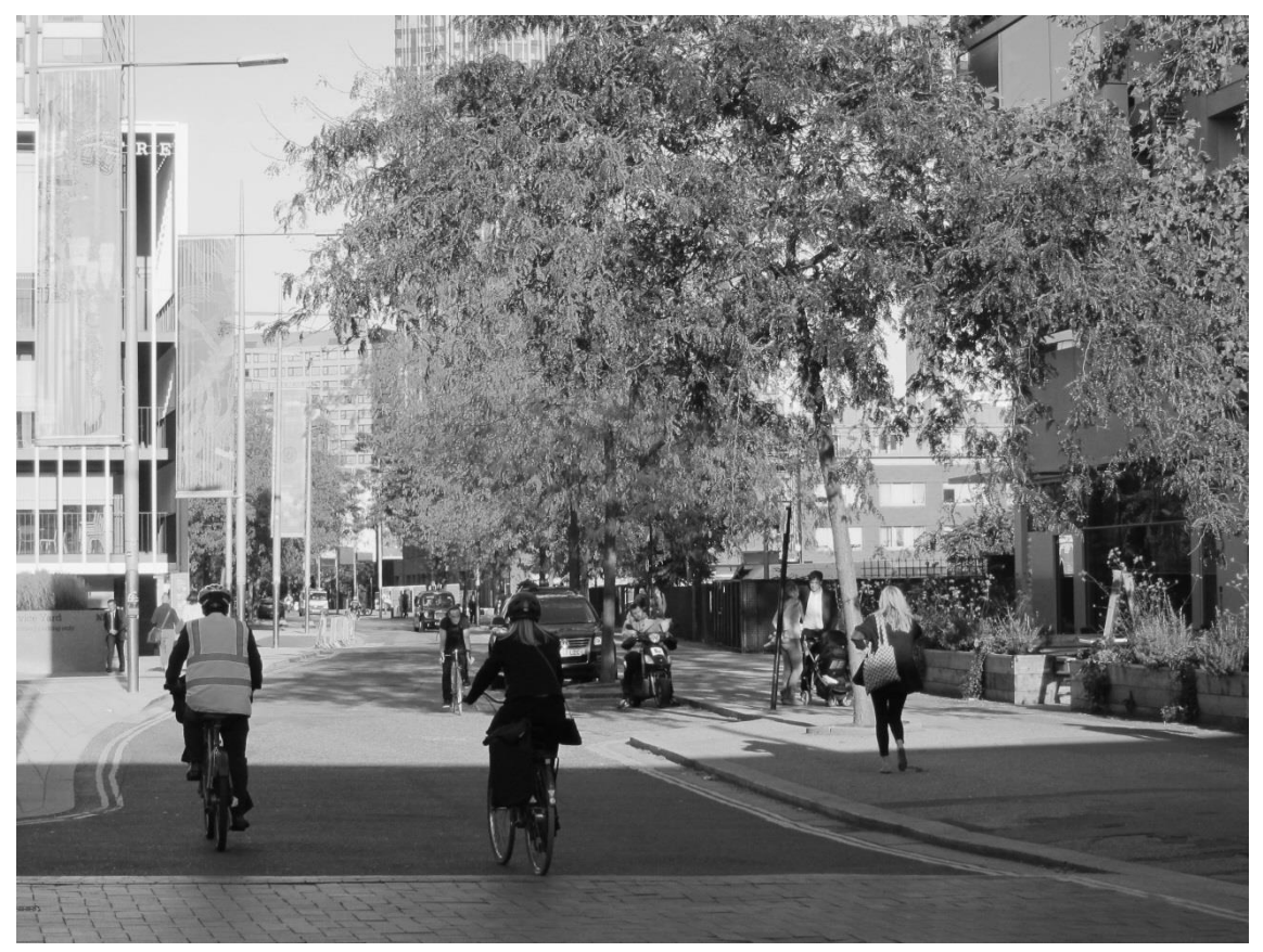
Figure 7. Section 106 monies cover capital investment in the Spine Route.

Myatts Fields North and Lewisham Parks are in the first group. In both cases, the initial capital investment came from the management organisation (the PFI consortium and Glendale) and should be paid back by the corresponding local authority as unitary charges, over a period of 25 years in Myatts Fields North and 10 years in Lewisham Parks. Maintenance costs are also paid back by the local authorities but in the Lewisham case, the renewed contract (2010) includes a 'savings clause', which transfers to Glendale the responsibility to find resources to make up for reduced maintenance payment transfers. Future capital investments are not included in any of the current contracts and will have to be negotiated in the future. In addition, some revenue-generating facilities in Myatts Fields North have been transferred to The Happenings while in the Lewisham case these facilities have been transferred to Glendale. The commercial income they get out from them is mostly employed to cover the 'saving clause' of their contract.