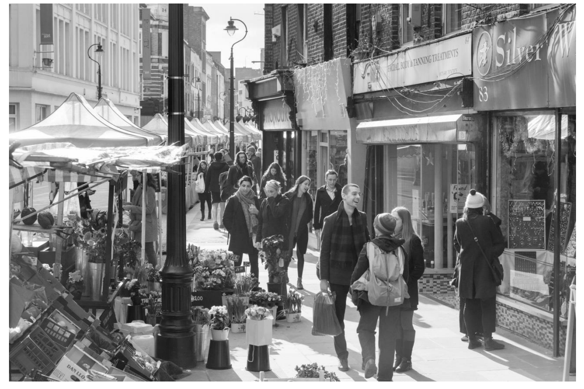
Figure 5. Lower Marsh market. Interests of market traders and street retailers accommodated in the Lower Marsh Market Steering Group.

In three of the other cases, local businesses were directly represented in the board of the management body. In Potters Fields, two of the seven seats in the trust board are occupied by business representatives: one by private office estate More London, representing their own interests as landowners and those of the occupiers of their buildings, and one by Team London Bridge BID representing its business membership (the BID levy-payer occupier of commercial property in the area). In Jubilee Gardens, the board includes representatives of large businesses and landowners (the London Eye, the Shell Centre, the Southbank Centre), of small businesses (2 at the time of writing), and of local business association the South Bank Employers Group (SBEG), whose representative chairs the board. In the case of the Spine Route, local business and landowners' interests were represented by SBEG in the original partnership, and are still represented in the ongoing negotiations by SBEG, the new Southbank BID, the Coin Street Community Builders (as major landowners) and the developers and commercial landowners for the new developments along the route.