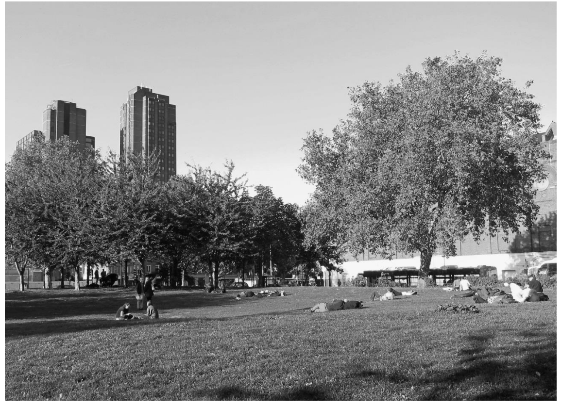
Figure 4. Waterloo Millennium Green, an open space managed by a community trust (BOST)

for local horticulture projects and provides informal horticultural training, landscape maintenance, garden maintenance, grounds maintenance and gardening work experience.