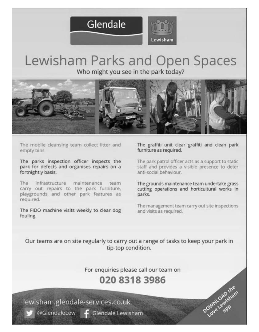
Figure 10. All open spaces in Lewisham are managed by one private contractor, under complex contractual rules.

This type comprises spaces in which the management is taken over by one key stakeholder, with the local authority in a strong position to retain strategic overseeing role while delegating management. These are spaces under council by-laws, with some self-regulating openness and accessibility but within a very tight framework set out in detailed contractual agreements. Accountability mechanisms are clear but complex, securing an exclusive say by the main stakeholders in each arrangement. As in the first type, there is weak and diffuse accountability for other stakeholders, many of which are indirectly represented by the local authority's presence in the management body.