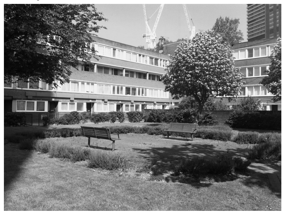
Figure 3. Resident-led space management inside one of the Leathermarket Area estates.

housing estates under their jurisdiction, and also, maintenance, minor and major works on the estates, including redevelopment. Public space management is a minor part of the agreement and it encompasses laying out and maintaining the grounds of the estates. Differently from typical Right to Manage contracts in which the tenant management body is paid a fee for their services, JMB is allowed to keep all the rent and service charges from leaseholders raised on their estates in return for a 30 year investment plan and the obligation to pay off the housing debt attributable to their property previously paid by Southwark Council. The contract is supervised directly by the local authority, the freeholders of the estates, with powers to intervene and revoke the agreement and take back management.