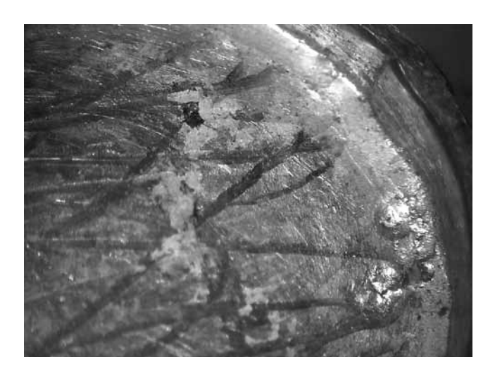
Figure 4: The bezel of gold signet finger-ring 1742/1476: the internal surfaces of the bezels are scratched. Figure 4: Le chaton de la bague à sceau 1742/1475: les surfaces internes du chaton ont été grattées.

It is of course possible that the copper was added intentionally; the effects of even small amounts of copper on hardness are relatively high, due to the c 12% difference in atomic radii between gold and copper (Hough et al. , 2009), while the effect on the colour is probably too low to have