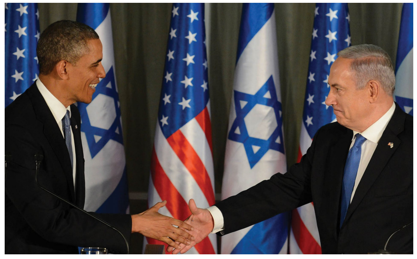
U.S. President Barack Obama shakes hands with Israel's Prime Minister Benjamin Netanyahu during their press conference in Jerusalem, part of Obama's official state visit to Israel and the Palestinian Territories in March 2013.

The depth of emotion that surrounds public and private conversations about the relationship between Israel and the U.S. can be staggering. From college campuses to church groups, think tanks to synagogues, and op-ed pages to congressional hearings, few issues are as contentious as America's relationship with the State of Israel.