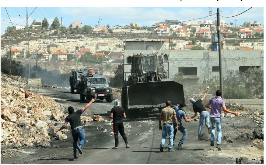
Palestinian protesters throw stones at Israeli vehicles during an October 2013 protest against the expanding of Jewish settlements in Kufr Qadoom village, near the West Bank city of Nablus.

In September 2010, Obama hosted Netanyahu, Abbas, Jordan's King Abdullah and Special Envoy Mitchell for the restart of negotiations to reach a final status settlement. As Israel's settlement moratorium lapsed, the talks broke down, and Mitchell eventually resigned from the office of the Special Envoy in May 2011.