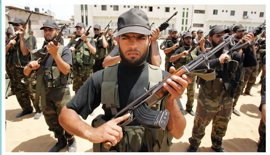
Hamas militia members take position after they evacuated Gaza streets in May 2006. The Hamas-led Palestinian government ordered its militia off Gaza's streets in the wake of clashes with President Mahmoud Abbas's rival Fatah movement that stirred fears of civil war.

ment between Israel and the Palestinians. Once again, the U.S. had come to the realization that peace between Israel and its neighbors was a necessity for securing U.S. interests in the region, and that by ignoring the urgency of the issue, the conflict had only been exacerbated.