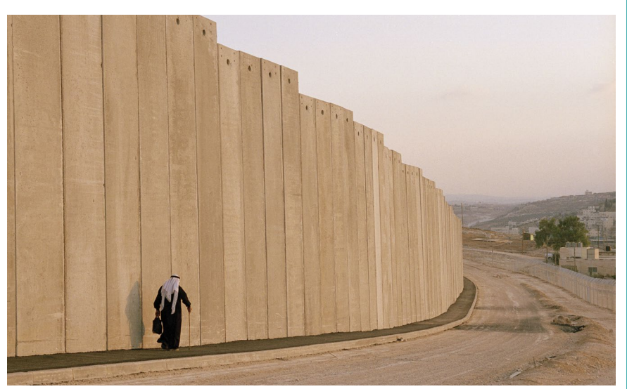
A Palestinian man walks along the Israeli-constructed barrier wall separating Jerusalem from Abu Dis, a village in the West Bank.

Secretary of State Condoleezza Rice led the Bush administration's revival of U.S. efforts to mediate peace, and invited Israelis, Palestinians and other Arab representatives to a conference in Annapolis, MD, in November 2007. The Annapolis Conference was intended to restart the peace process and boost international support for a negotiated settle-