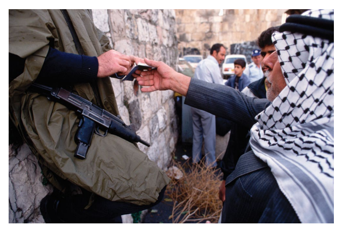
A Palestinian hands his I.D. to an Israeli solider at a Jerusalem checkpoint in 1991.

in January 2001, by which point the Al-Aqsa Intifada , or the second Intifada , had erupted.