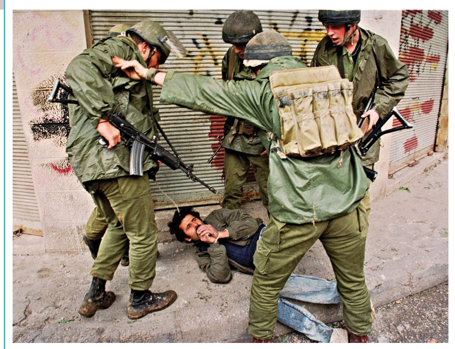
An Israeli soldier restrains another from manhandling an arrested Palestinian who lies on a Nablus street with his hands tied together, during anti-Israeli demonstrations in the first intifada in February 1988.

manner that has affected both countries well into the 21st century.