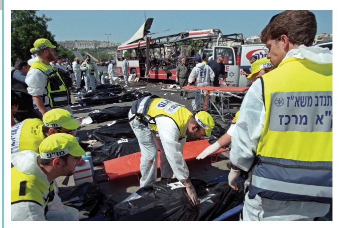
Rescue crews remove body bags from the site of a Palestinian suicide bomb attack on a Jerusalem bus in June 2002.