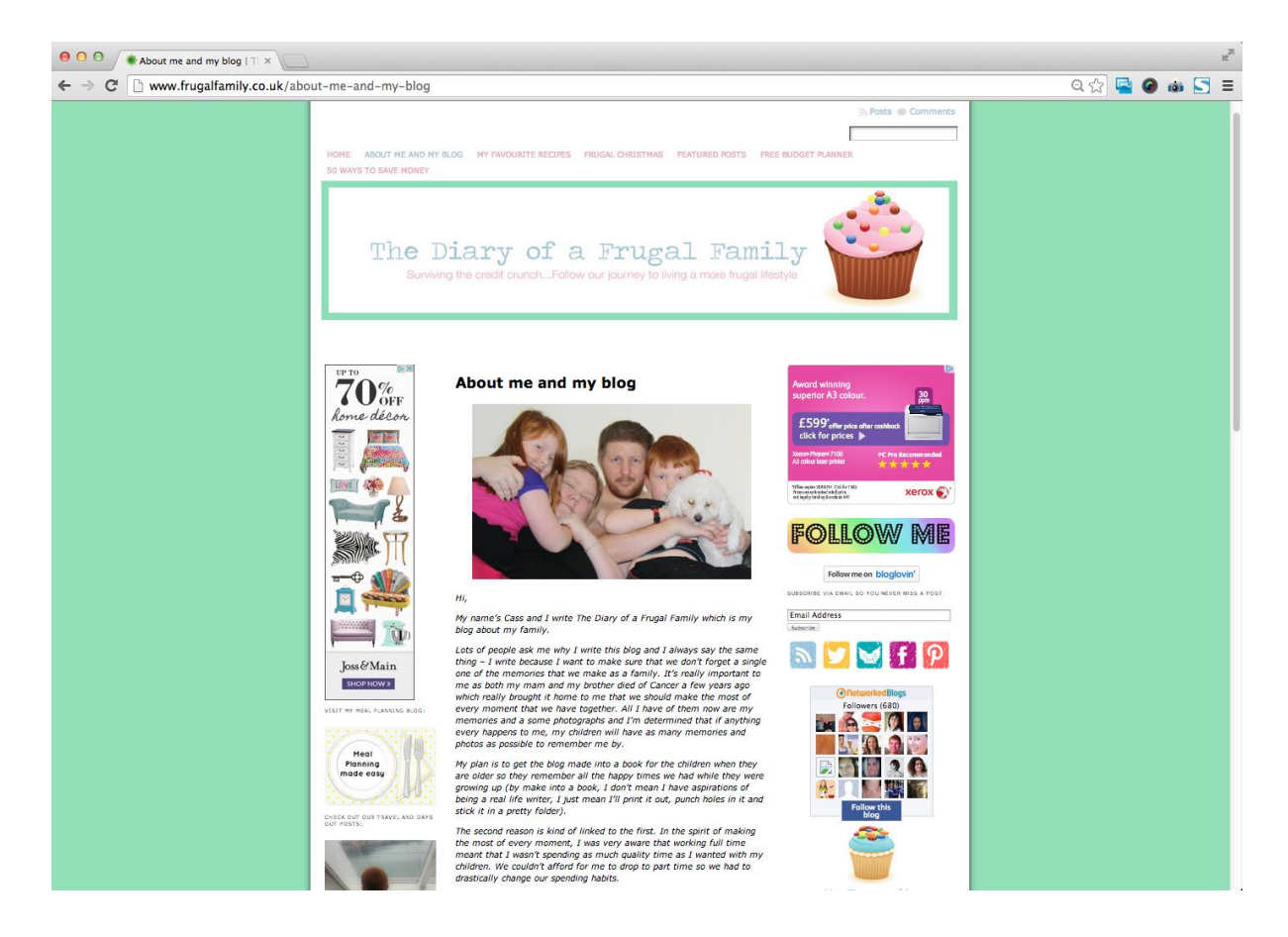
Surviving the credit crunch... Follow our journey to living a more frugal lifestyle

The 'Diary of a Frugal Family' blog seems, even on the 'About Me' page, predominantly writing-driven. Writing and image tell similar stories, but also some different ones. Both the title and the strapline, for instance, reference living through scarcity of economic resources ('frugal', the 'credit crunch'), as does one of the 'why I blog' stories on the page, which describes saving money and trying to clear debt in order to be able to work fewer hours and spend more time with family. Many of the blog posts also describe 'credit crunch' strategies for economising on costs, especially food costs – strategies that belong to the large body of family food practices invisibly shaped by mothers (KAN ET AL, 2011).