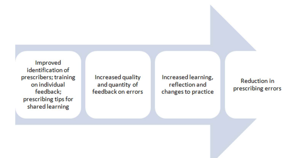
Figure 1 Logic model: basic high-level model depicting the planned inputs and intended results.<sup>16</sup>

Previous research suggests specific mechanisms that maximise the effectiveness of feedback and its capacity to elicit behavioural change. Feedback is most effective when provided more than once, using both verbal and written formats and including both explicit targets and an action plan.<sup>7</sup> <sup>19</sup> To develop interventions that incorporated this best practice, a panel of six existing junior doctors was recruited to contribute to initial development and testing using plan-dostudy-act (PDSA) cycles between February and July 2013. We focused on three linked interventions: improving prescriber identification, developing an agreed approach for pharmacists to use when providing feedback on individual prescribing errors and a