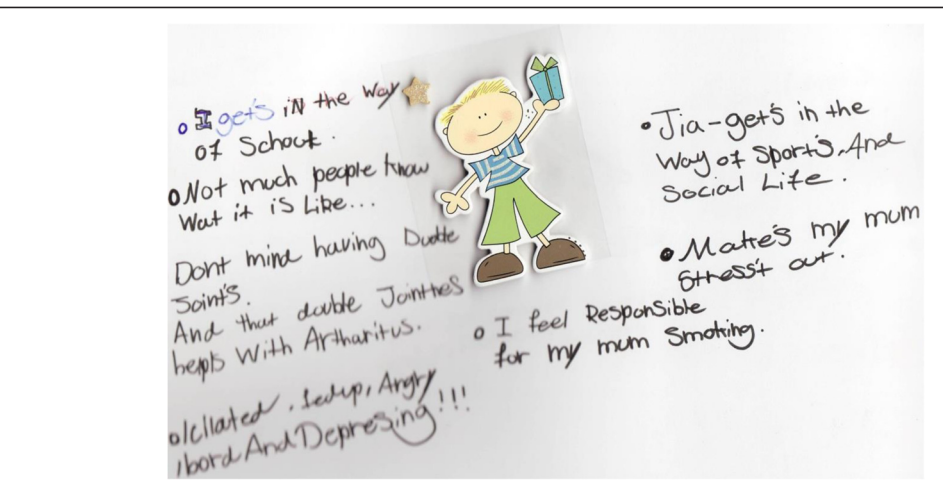
Fig. 1 A spider diagram drawn by one of the young participants. This is one of the spider diagrams written by one of the young people. The young person used this space to write about how their arthritis makes them feel. The sticker in the middle was for the young person to visualise themselves in the middle, and the words written around the outside describe how they feel and their concerns. Some examples of the text written here include such comments as; 'Isolated, fed up, angry, bored and depressing', 'I feel responsible for my mum smoking' and 'JIA gets in the way of sports and social life'

When the seventh stage of data analysis was approached (return to the subject and check they agree with the