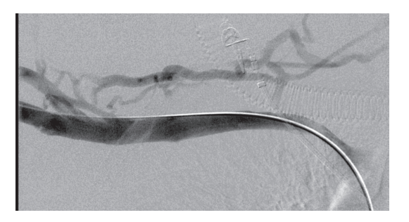
FIGURE 3: Digitial subtraction venogram following PMT, showing complete recanalisation of the occluded subclavian vein.

Postthrombotic syndrome (PTS) is a complication of venous thrombosis and has recently been recognised in upper-limb DVT. With an overall incidence of 7%–46% [3], it comprises a constellation of chronic pain, paraesthesia, heaviness, and functional limitation which can significantly impact patients' quality of life.