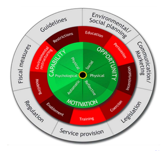
Figure 1 Behaviour change wheel (adapted from Sinnott et al <sup>24</sup> and Mitchie et al ). <sup>25</sup>

The BCW incorporates a comprehensive panel of nine intervention functions, shown in figure 1, which were drawn from a synthesis of 19 frameworks of behavioural-intervention strategies. We determined which intervention functions would be most likely to effect behavioural change in our intervention by mapping the individual components of the COM-B behavioural analysis onto the published BCW linkage matrices...<sup>24</sup>