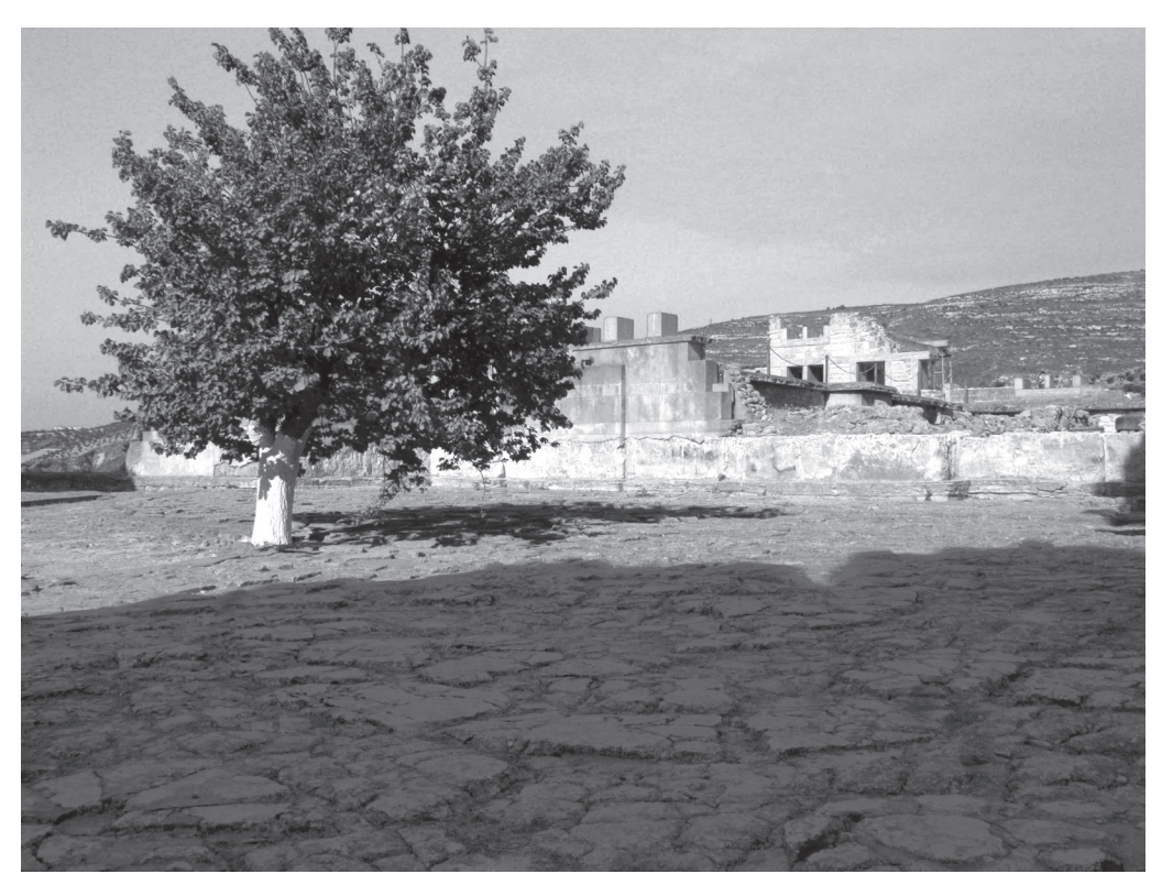
Figure 2.4: West court and west façade at Knossos palace.

Social dynamism on Middle Bronze Age Crete cannot be explained solely through the agency of a few, or the influence of external interactions. Changes seem to have been driven by large social groups that are emphasising new collective identities, such as co-residential communities in a new regional competitive framework. The main changes in the record do not refer to the appearance of distinctions but to the redefinition of significant social groups and identities, and the appearance of new regional arenas of interaction. While privileged individuals would have gained new social positions in this process, and it is most likely that in some large cemeteries certain small groups may have acquired greater importance (Legarra Herrero 2011b), there is no indication in the record that they were able to construct a new language