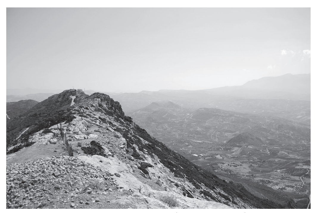
Figure 2.3: Yuktas peak sanctuary (photograph by author).

Without easily-recognisable elites, valuable exotica and clear emulation processes, change on Middle Bronze Age Crete is in need of new explanations. I have already mentioned that cemeteries underwent major transformations that encouraged social practices and group activities, and that new sealing systems seem to indicate regional community identities. Similar social trends can be traced in other newly-created social arenas, such as peak sanctuaries (Figure 2.3); open areas located on certain