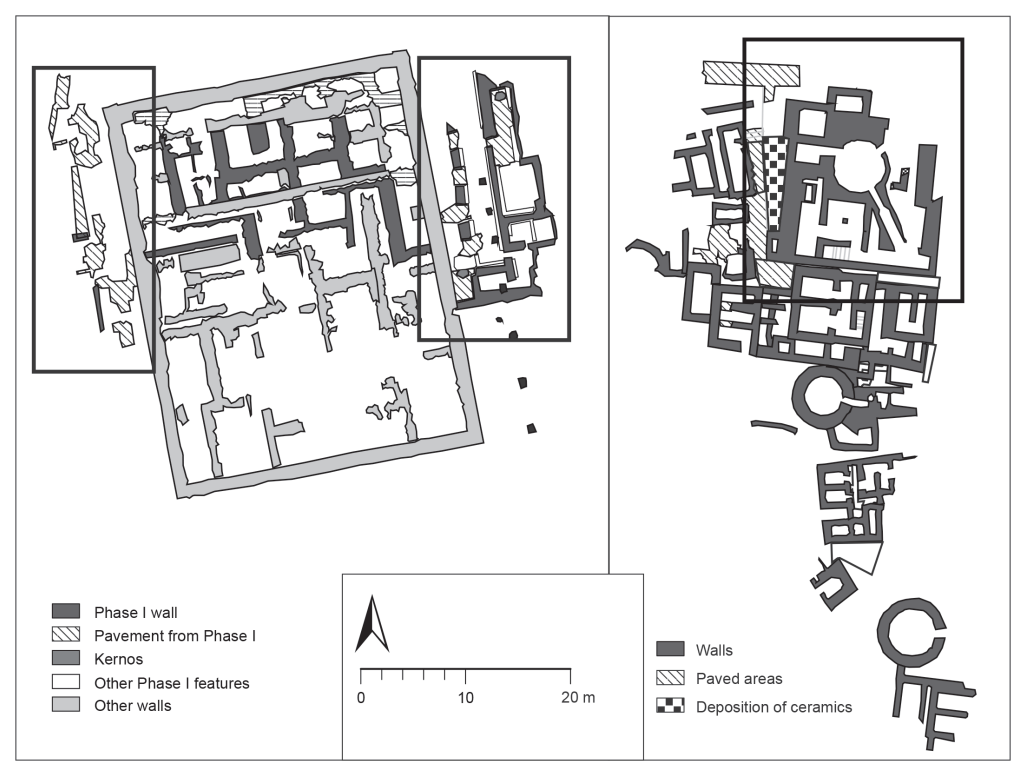
Figure 2.1: Chrysolakkos I (EM III/MM IA) cemetery at Mallia and Archanes cemetery (MM IA) with areas used for group ritual highlighted (redrawn by author).

The role of exotica in Middle Bronze Age Cretan society also needs revision. While authors have interpreted this material as evidence of new influences from Egypt (Watrous 1998; Aruz 2008; Wiener 2013), careful investigation of the material reveals strong local patterns of consumption that do not necessarily fit well with ideas of either conspicuous consumption or emulation (Legarra Herrero 2011a). Newly-imported items, or objects made in imported materials are few in number and represent a narrow and strange selection of items, mainly scarabs (actual imports and local imitations) and a limited range of Egyptian stone vessel types. Local imitations of these two types of items are a little more common, but do not register a significantly different pattern of deposition. Neither scarabs nor the type of stone vessels found on Crete are popular in Egypt during this period, but they are linked to two types of items that become