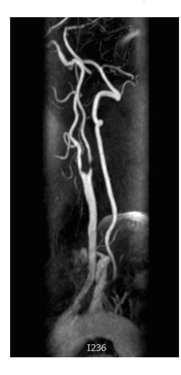
Figure 2 : Contrast-enhanced magnetic resonance angiogram showing near occlusion of the internal carotid artery.