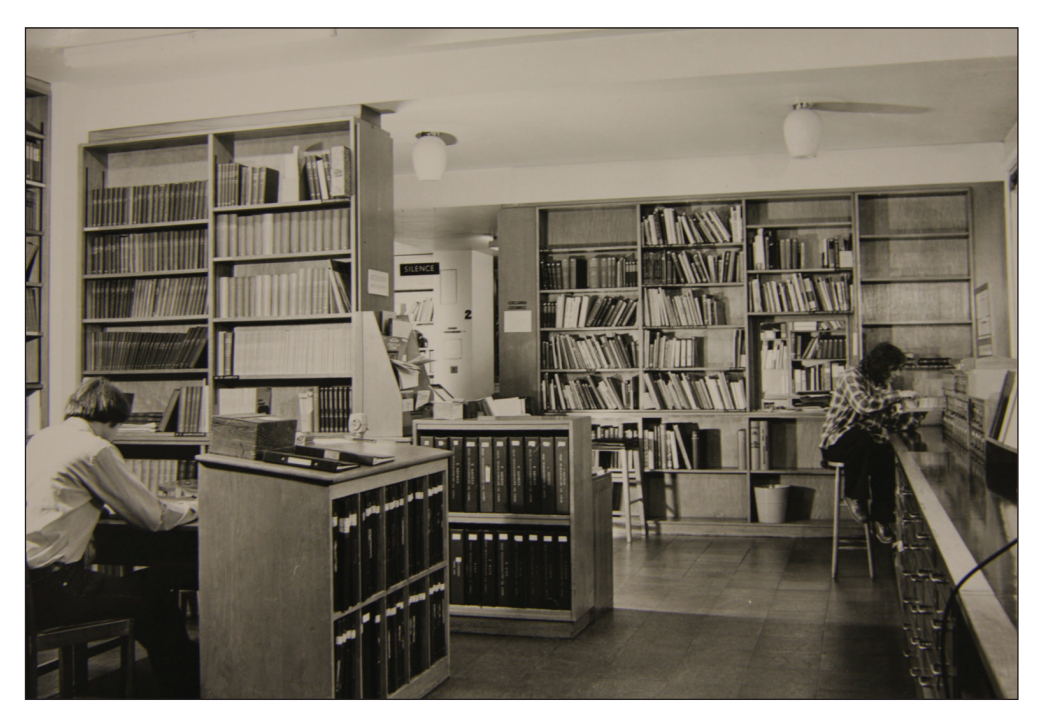
Figure 4: The First Floor Gordon Square Library.

Book collections continued to be expanded, but at a reduced rate, owing to a steady decline in book funds and rising costs. Funds were limited, but readily available, in the 1960s (e. g. Annual Report 1965: 135), but they later became inadequate, as is repeatedly stated (e.g. Annual Report 1987: 46). Good relations between archaeologists and publishers began to break down in the 1960s, owing to increased commercialisation of the book trade. In the 1980s many traditional publishing partners were swallowed up by international conglomerates (Bradley 2008: 169–176; xi–xii), ending once favourable connections permanently. Ingenious solutions were used to make up shortfalls, demonstrating the financial creativity of the librarians, particularly Bell. Traditional donations and exchanges continued to be used to great advantage; the Library received significant bequests, notably from Taylor (Annual Report 1984: 41). Duplicate pamphlets were sold (Annual Report 1985: 46); grants were used to purchase specialist materials, notably a grant from the central University of London