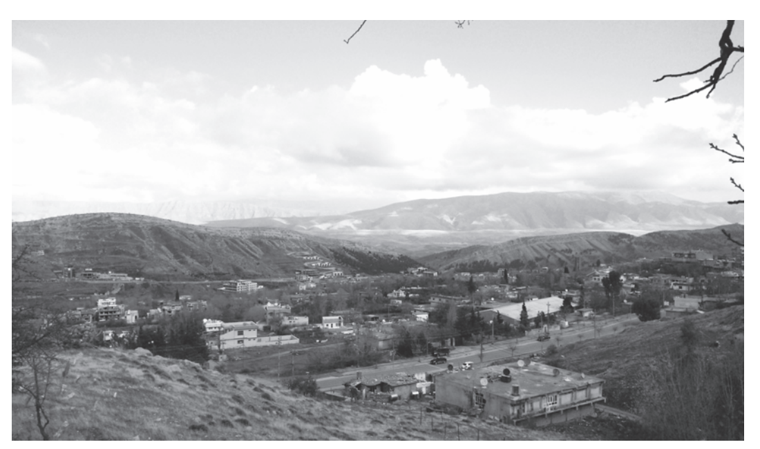
The town of Shaqlawa viewed from the Sahaba Cemetery. Photo: Tyler Fisher, December 2014.

use of the site: no other cadavers can be interred in that place, for the land will reject such bodies. In spite of a perceived scarcity of suitable land for graves in the vicinity of Shaqlawa, the Sahaba Cemetery remains off-limits for fresh burials.