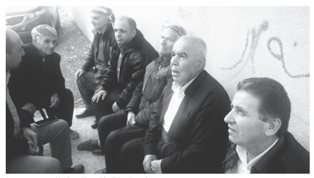
A group interview in Shaqlawa.

One cannot say that they [the Sahaba ] were the same as IS. When the Sahaba came, there were no Muslims around, but IS is fighting Muslims.