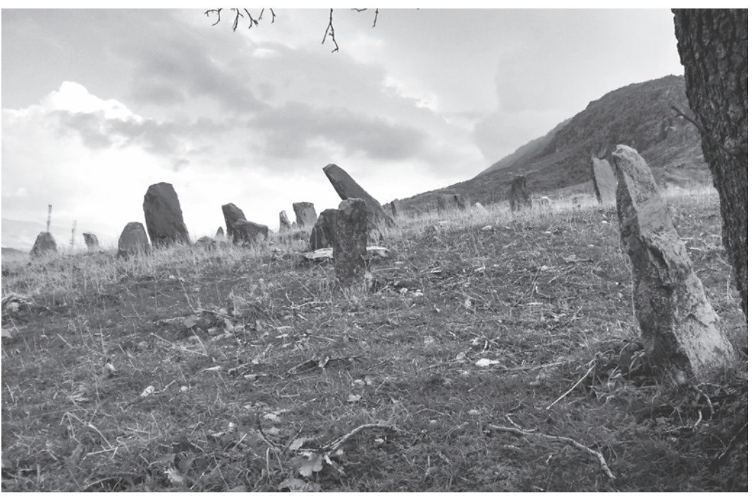
Gravestones in the Sahaba Cemtery. Photo: Tyler Fisher, December 2014.