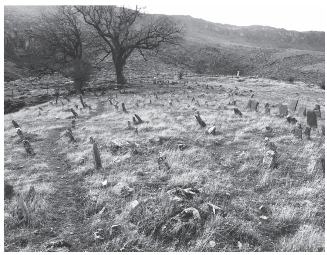
The Sahaba Cemetery in Shaqlawa. Photo: Tyler Fisher, December 2014.