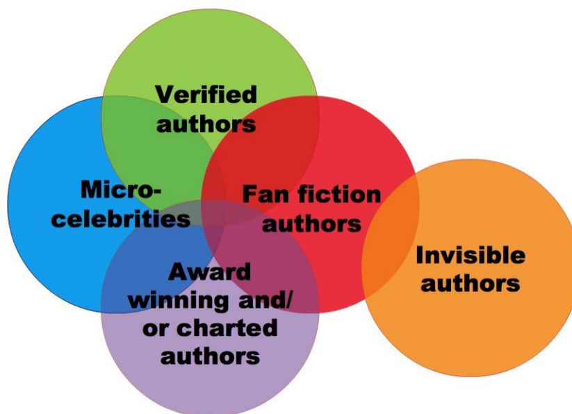
Figure 3: Authorship on Wattpad

Atwood co-authored a story with the less well-known Alderman. Atwood's association with Alderman – one author endorsing another – reinforces and elevates Naomi Alderman's status. This study found that there were five main types of author on Wattpad (see figure 3): (1) Verified; (2) Fan fiction authors; (3) Micro-celebrities; (4) (Wattpad) Award winners and/or charted authors; (5) Invisible authors. Despite the clear hierarchies in social authorship: this study has found that it is possible to bridge the gap between the different categories and enhance authority, influence, and visibility on Wattpad.