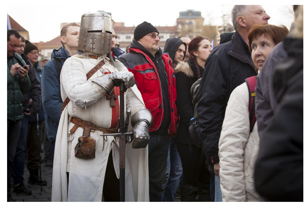
Figure 18. Anti-refugee protests in Prague, 6 February 2016.

region, which witnessed similar moods in response to the refugee crisis and European terrorist attacks of 2015.8