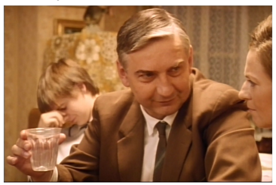
Figure 6. Pelíšky (Cosy Dens). Jan Hřebejk (director) and Petr Jarchovský (screenwriter), 1999. This kind of ironic reading deliberately elides political questions and is concerned with the aesthetic surface of the series. The aesthetic surface of the