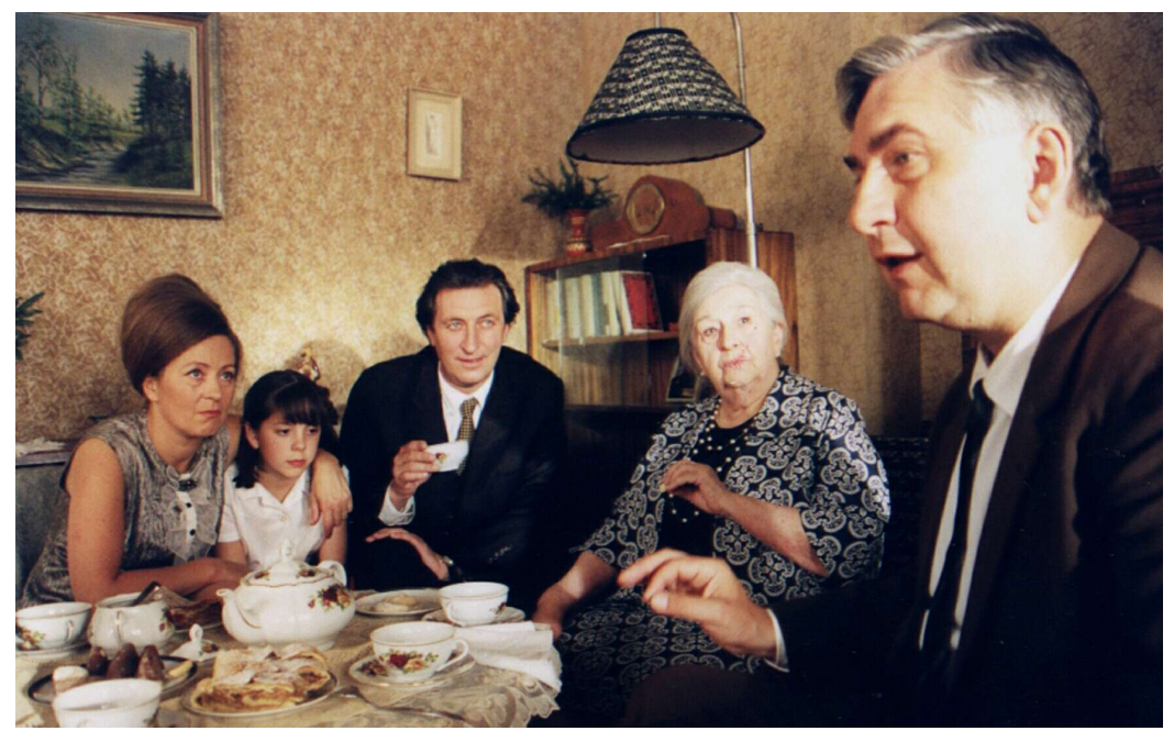
Figure 7. Pelíšky (Cosy Dens). Jan Hřebejk (director) and Petr Jarchovský (screenwriter), 1999.

The film's investment in apolitical domesticity, together with its retro mode, would seem to make it a prime example of what Jameson perceives as a lack of historicity in postmodern culture. Certainly, Pelíšky has been read as ahistorical. Jan Čulík, for example, argues that the focus on the family and domesticity is historically inaccurate in the film, prefiguring the period of Normalizaton and its ethos of the separation of the public and the private, which he summarizes as follows: 'The Normalization message is clear: don't bother us with politics. We want to live a calm enclosed family life, focusing on interpersonal relationships.' Françoise Mayer believes that this accounted for the success of Pelíšky, Kolja , and similar films, 113 suggesting that the film's ostensible investment in the non-political had a wide popular appeal. However, while it attempts to create an apolitical space, the film itself, as well as responses to it, cannot avoid carrying certain historical and political assumptions.