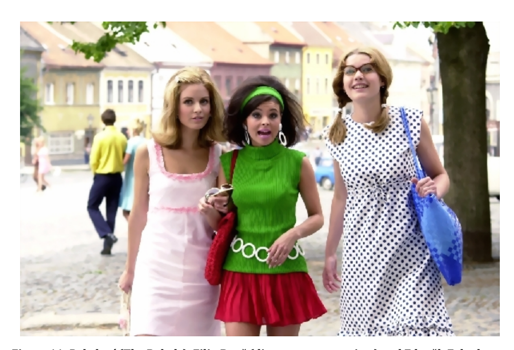
Figure 11. Rebelové (The Rebels). Filip Renč (director, screenwriter) and Zdeněk Zelenka (screenwriter), 2001.

particularly strong sentiment towards the past in this case – available to a generation as well as those observing the generation from the outside, without suggesting that such an attitude must necessarily be universal in all members of that generation. Retro thus appeals not only to those for whom the objects, fashions, and music in these representations act as memory triggers; its lack of experiential investment in the period allows for precisely the kind of distance that facilitates irony and thus enables an appreciation of the playful and at times irreverent appropriation of the past in the film and TV series under discussion. The socialist past is figured through an overabundance of period markers, which represent the past, but do not aim to recreate it accurately.