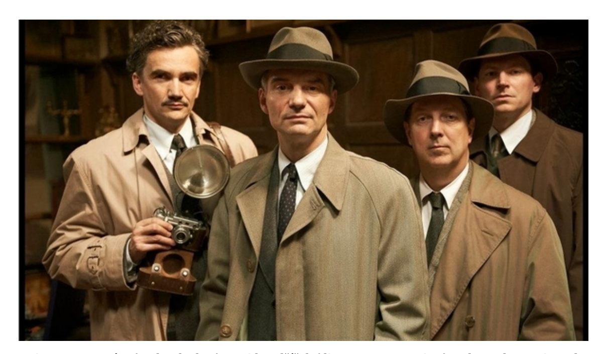
Figure 16. Ve stínu (In the Shadow), David Ondříček (director, screenwriter) and Marek Epstein and Misha Votruba (screenwriters), 2012.

glamorize anything, but on the contrary set up a cool analytical distance from the heroes, its careful attention to detail as well as the overall perception of space, the film allows the time of Normalization to be felt particularly sharply'.<sup>85</sup> A muted colour palette in greys and browns is the main visual authenticating mechanism of Pouta , as well as the other films. The figuration of Normalization as grey in the popular imagination discussed in chapter 4, which Pouta and Fair Play , both set in the 1980s, effectively play on, stretches out to the whole socialist period, including the 1950s in Ve stínu and the late 60s in Hořící keř . In an interview, the director of Ve stínu , David Ondříček, remarked on the setting of the film: 'the costumes and props almost completely lacked warm colours, because the period lacked them too'.<sup>86</sup>