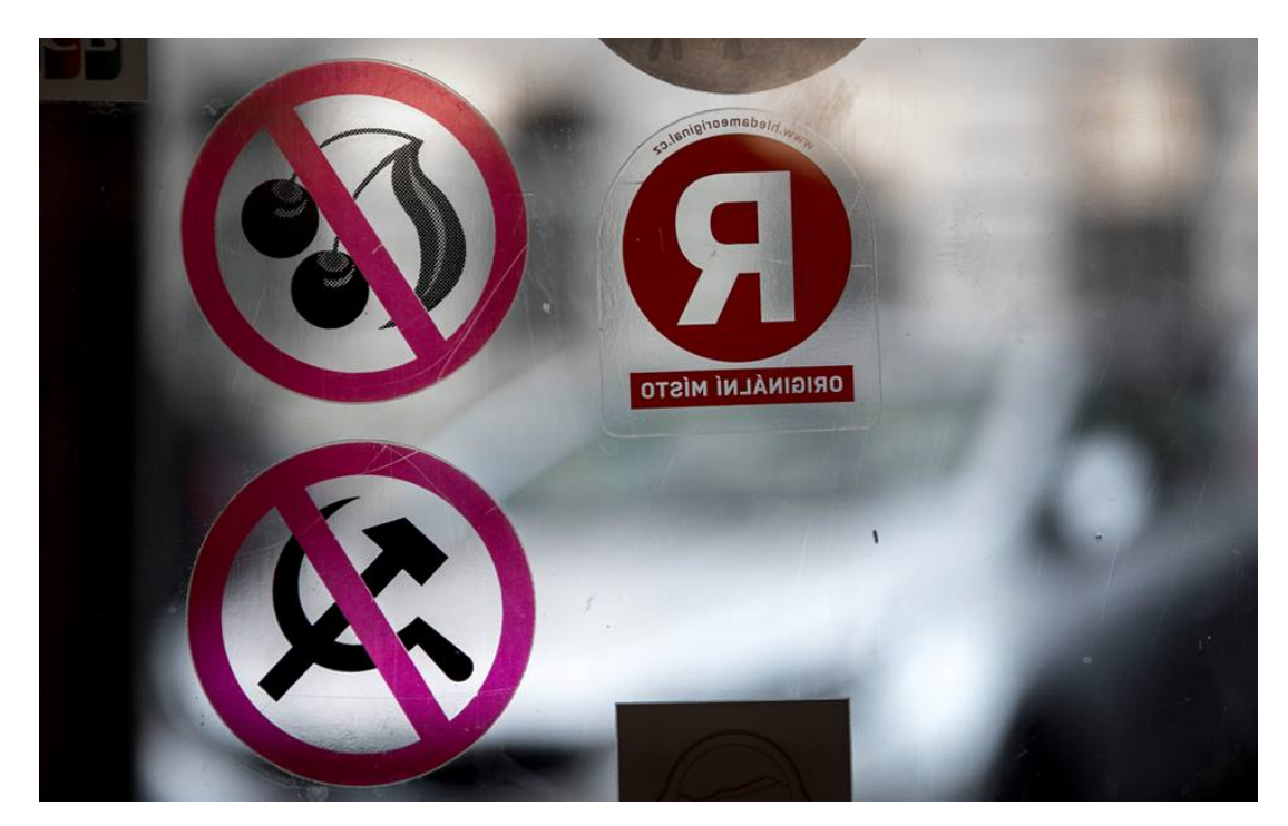
Figure 1. The door of Café Kaaba, Prague.

On a tree-lined street in Prague's upmarket district of Vinohrady, Café Kaaba invites customers to drink a coffee in an interior decorated in 'Brussels Style', the late 1950s and early 1960s wave of design that followed the success of the Czechoslovak Pavilion at the World's Fair in Brussels in 1958.¹ Before entering, Kaaba proudly informs customers of its attitude towards the state socialist past² on its door. On a sticker with a crossed-out red circle, where one would often find the symbol of a dog to indicate that pets are not welcome, Kaaba features a crossed out sickle and hammer. A second sticker displays crossed out cherries, the symbol