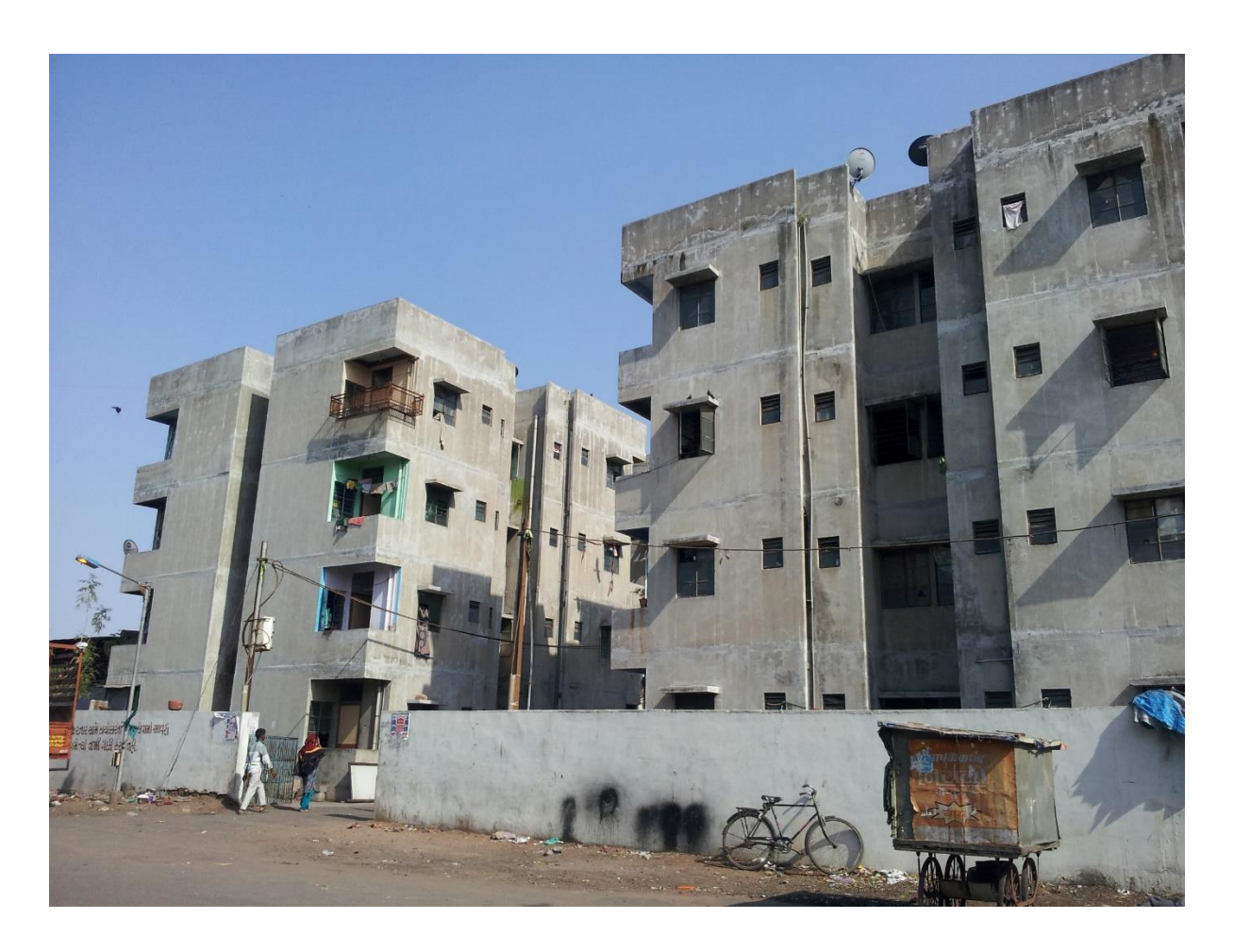
Figure 2: BSUP housing in Vatva