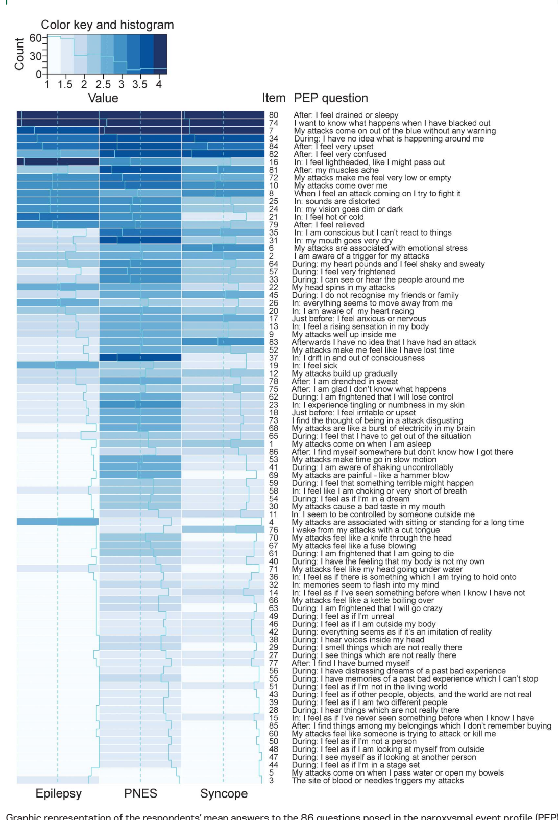
Graphic representation of the respondents' mean answers to the 86 questions posed in the paroxysmal event profile (PEP) illustrates the relative diagnostic value of individual items. Mean answers are indicated for each group by the light blue line. The shade of the background color also indicates the mean response (with dark shades reflecting more frequent experiences and light shades less frequent experiences).