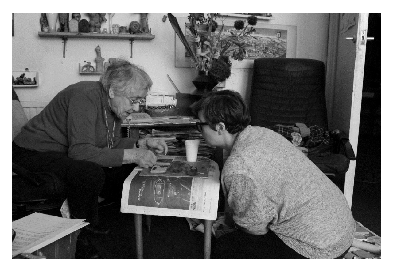
Figure 2 - Tile making on Festival in a Box visits.