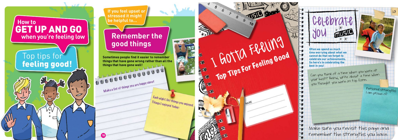
Fig. 1 Example pages from the intervention booklets, “ How to Get Up and Go When You’re Feeling Low ” (left panels) and “ I Gotta Feeling ” (right panels). Copies of the booklets are available from the authors

hindered by low mental health literacy and stigmatising attitudes towards mental health problems [8]. The provision of booklets and other forms of information have been recommended as potential low-cost routes for promoting improved recognition of mental health symptoms in young people [9]. Increased knowledge about mental health problems has also been shown to be associated with improved self-management, such as appropriate help seeking [8, 10, 11]. Given the potential for wide dissemination of information booklets, even very small effects of this type of intervention may translate into meaningful impact on mental health and well-being at the population level. However, rigorous evaluation is needed to determine whether this is indeed the case.