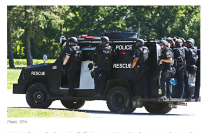
Married couple from Suffolk County, New York, was unpleasantly surprised by discovering six men from a joint terrorism task force at their house who came to check if they were terrorists. The raid was caused by "suspicious" web search of "pressure cookers" and "backpacks".

Americans googling 'pressure cookers' end up being questioned by security forces