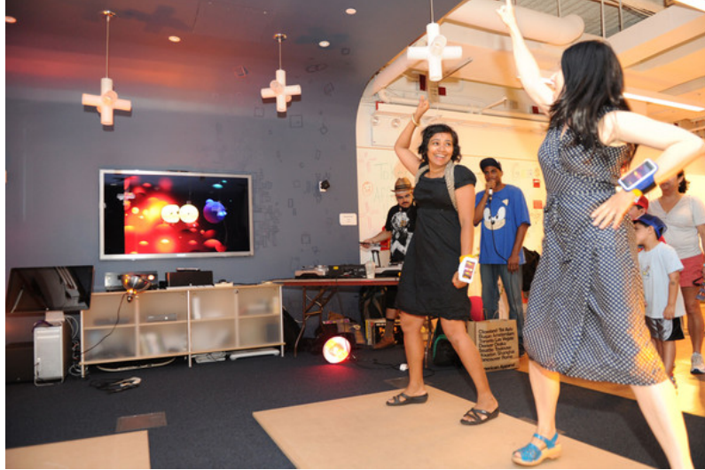
Fig. 1. Yamove! [28] encourages improvisation from players, allowing for a range of emotional expression. The game's core mechanic is improvised dance. Two dance pairs compete against each other in a dance battle. Each pair makes up moves that they can do well together--scoring is based on synchrony of movement, as well as creativity and pace.