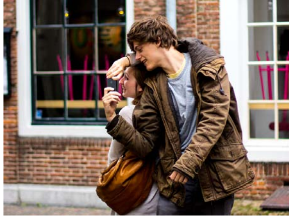
Fig. 3. Bounden (2015) is a smartphone-based game that requires two players to each have their thumb on the screen, working together to keep a virtual sphere visible and move it through a path of rings by tilting and rotating the device together. The moves that result were actually choreographed by the Dutch National Ballet, ensuring a (somewhat) graceful result.